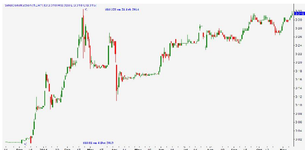
Figure 3. As permitted by ASIC Class Order 07/429, this chart contains SGX share price trading information sourced from Shareinvestor.com without its consent.