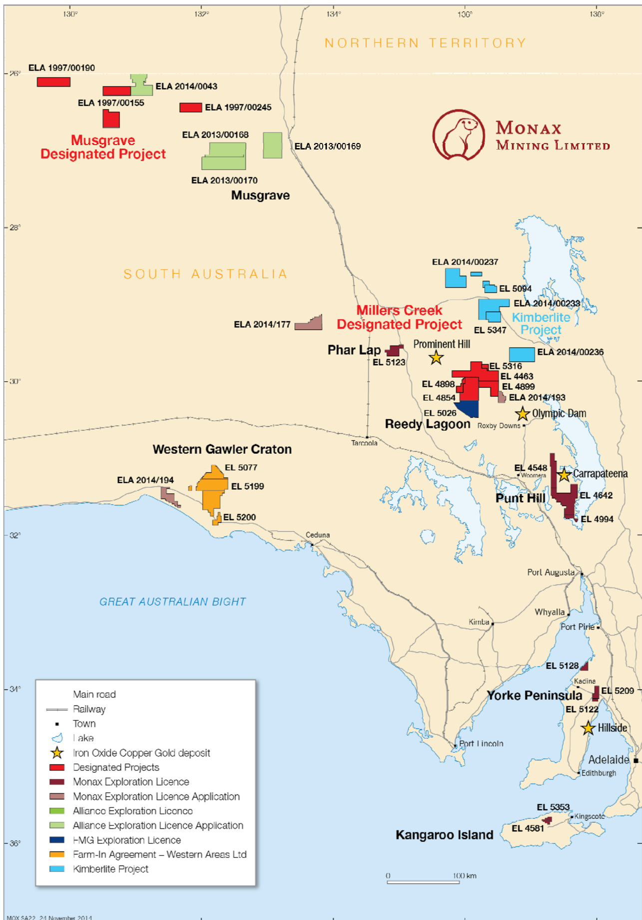
Figure 1. Monax tenement location plan.