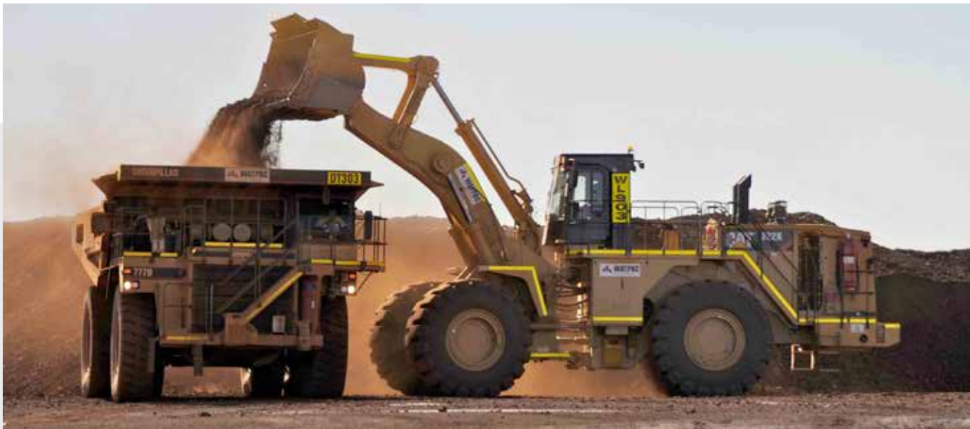
Nullagine Iron Ore Project