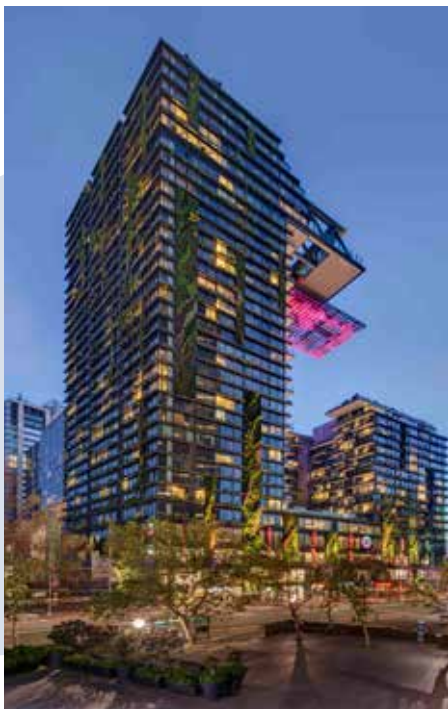
One Central Park