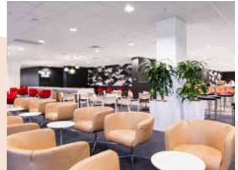
Darwin International Airport Expansion

Watpac is delivering a major upgrade of the Overseas Passenger Terminal at Circular Quay in Sydney. The main scope of works includes extending and refurbishing the ground floor to increase passenger capacity and improving access via road upgrades, a new taxi drop off area and the installation of new internal and external lifts. The upgrade will also deliver a new mezzanine floor to increase the Terminal's internal seating capacity and an extension to the south forecourt to provide additional covered seating areas. Construction is well advanced with works taking place in a live and operational passenger terminal. Site activities have continued 24 hours a day seven days a week since September in order to accelerate the works, which will be progressively handed over from late December 2014.