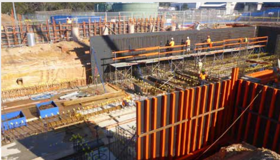
ANSTO Nuclear Medicine Molybdenum-99 Facility

Watpac commenced work on the Australian Nuclear Science and Technology Organisation (ANSTO) Nuclear Medicine Molybdenum-99 Facility in May 2014. The new multi-level 4,250 square metre facility at Lucas Heights will significantly increase ANSTO's capacity to produce the radioisotope molybdenum-99 – an active pharmaceutical ingredient used in more than 45 million nuclear medicine diagnostic procedures each year worldwide. Structural work has commenced on site including the use of a high density concrete using aggregates specifically imported from overseas. Hot cells that will be installed at the facility are undergoing nuclear design and fabrication in the US.