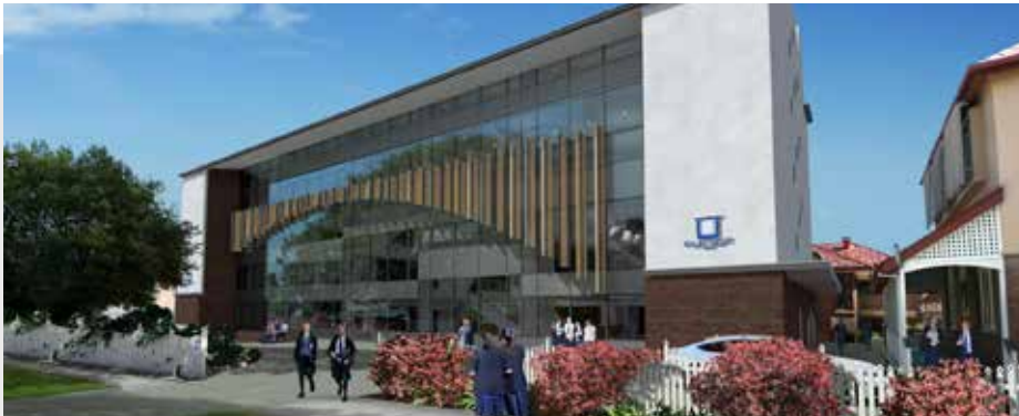
Brisbane Girls Grammar School Year 7 and Research Centre