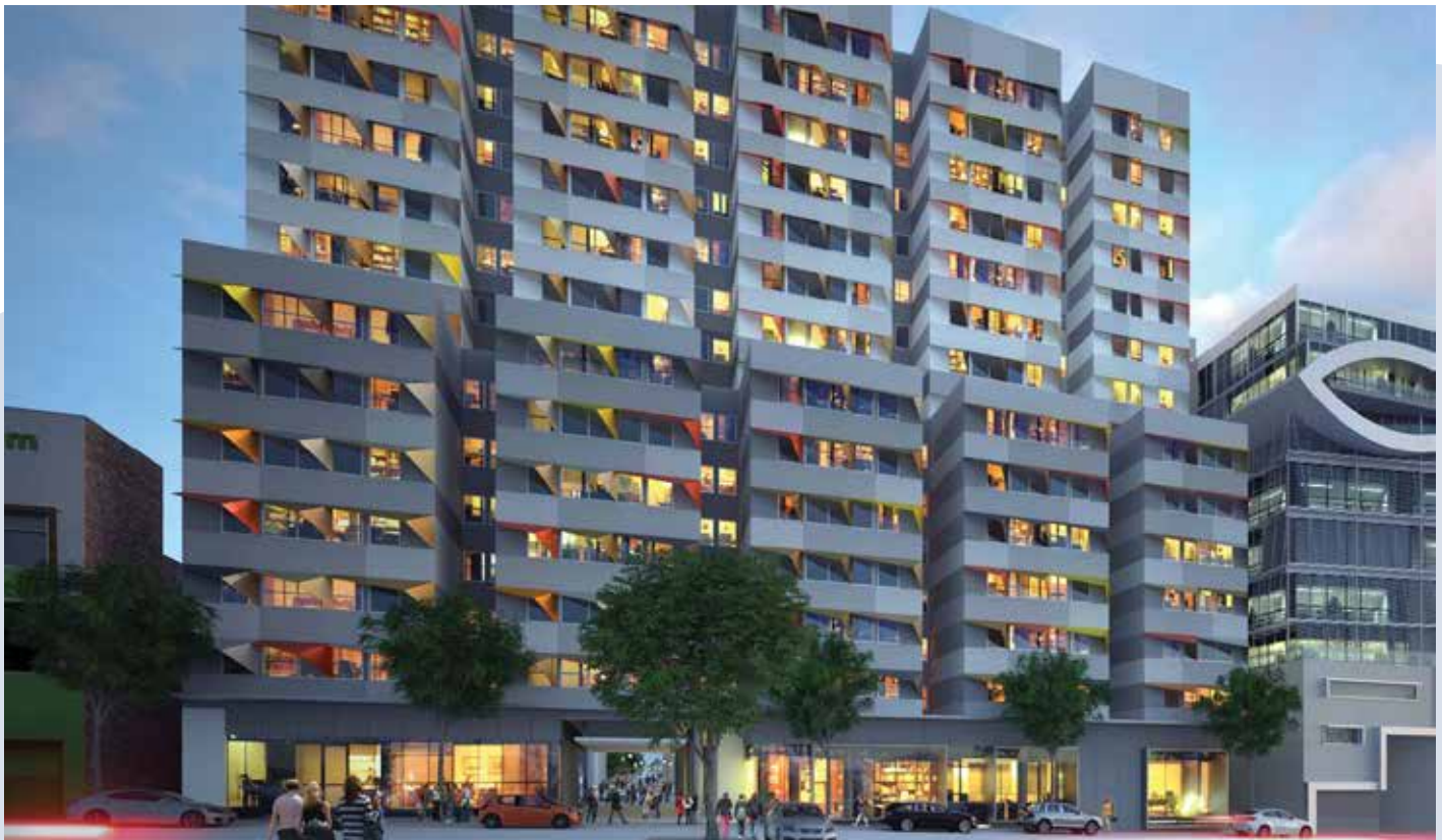
Leicester Street Student Accommodation