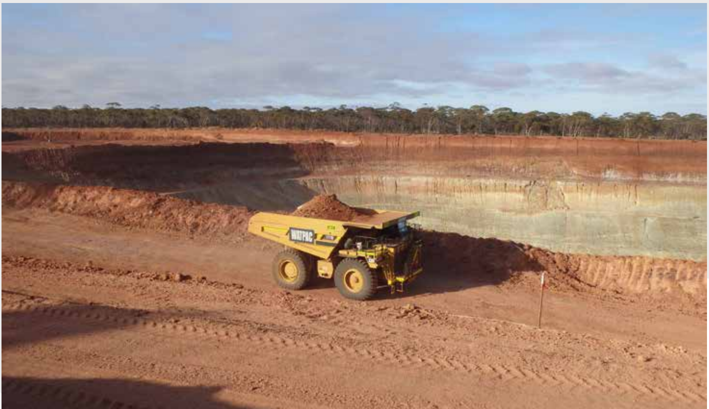
Hanking Gold Mining

Pluton Resources' iron ore mine at Cockatoo Island is located off the coast of northern Western Australia. Works on the initial two-year agreement commenced in November 2012, including the commissioning of a new crushing and screening facility. Watpac is responsible for all operational mining and civil infrastructure services to the iron ore project, including drill and blast, loading, haulage and processing of ore for direct shipping. Watpac also has responsibility for managing all other aspects of working in a remote location including camp, air travel and barge deliveries on and off the island. Significant milestones include the commencement and soon to be completed section of the stage 4 sea wall, which will allow Watpac to access parts of the ore body previously out of reach.