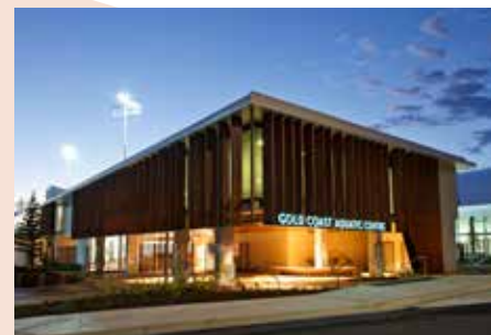
Gold Coast Aquatic Centre

Watpac has been awarded Stage 1 managing contractor services for construction of the Queensland State Velodrome in Brisbane for the Gold Coast 2018 Commonwealth Games. This is the second project Watpac is undertaking for this international event. The $55M velodrome will include a world-class timber track, streamlined roof design, mixed use sports courts, function spaces and a café. Construction commenced in November 2014 with works expected to be completed by mid-2016.