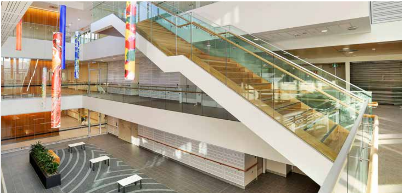
Port Macquarie Base Hospital

The Port Macquarie Base Hospital Expansion project achieved practical completion in June 2014. Works comprised of a new four-storey clinical extension to the existing hospital including improved access to a wider range of services such as cardiology including a new Cardiac Catheterisation Laboratory, increased capacity for elective surgery, and Emergency Department admissions. In addition, the