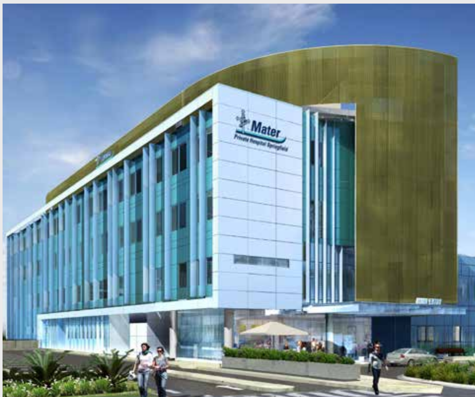
Mater Private Hospital Springfield