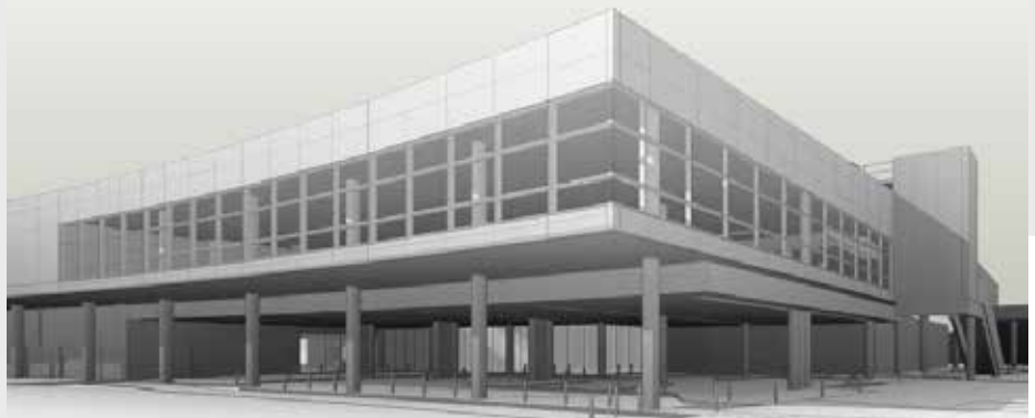
BAC Domestic Terminal Expansion

Watpac has been awarded the design and construction of Baiada's new protein plant in Tamworth. Watpac Specialty Services is working closely with Baiada's Danish equipment suppliers to design the new state-of-the-art-facility, which will feature both low and high temperature processing. This project is being fast tracked, with works commencing in April 2014 and scheduled for completion in April 2015.