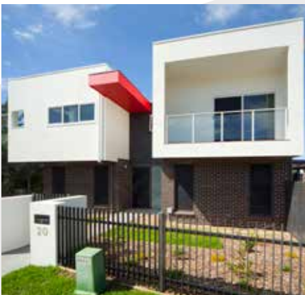
AE2 residential community