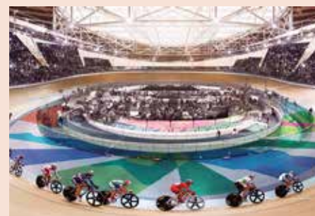
Queensland State Velodrome