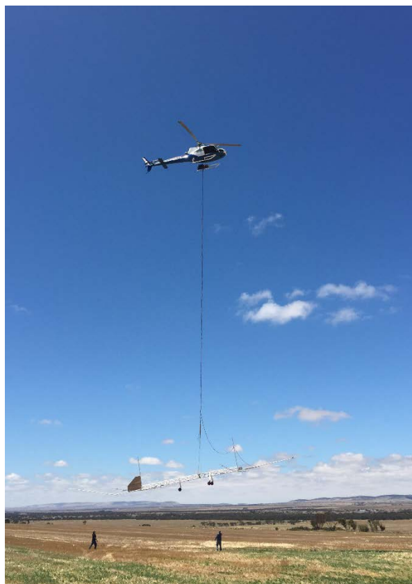
Figure 1: Airborne EM being undertaken on Melton Project

The survey was flown by a Eurocopter Squirrel BA helicopter and used the RepTEM system 1 . Lines were acquired on 100 metre line spacing with some lines tied to the Moonta GeoTEM BHP 1998 survey (see ASX Release dated 13 January 2015). A total of 307 line kilometres of EM and magnetic data were acquired. A depiction of those lines is in Figure 2 below.