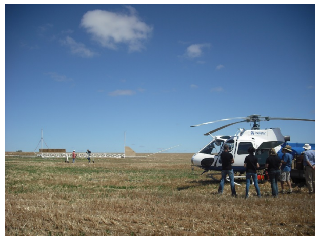
Figure 3: Scenes from airborne EM survey at Melton copper project