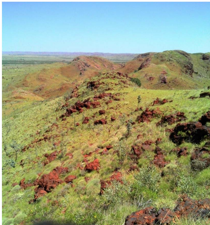
Figure 2 - Eginbah Prospect.