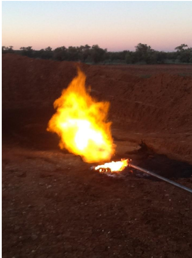
Figure 1 – Flare from upper Patchawarra Formation flow test at Tamarama-1

The testing program continues to progress as scheduled at Tamarama-1, with completion and testing program from Real Energy’s Queenscliff-1 well is expected to be conducted next week.