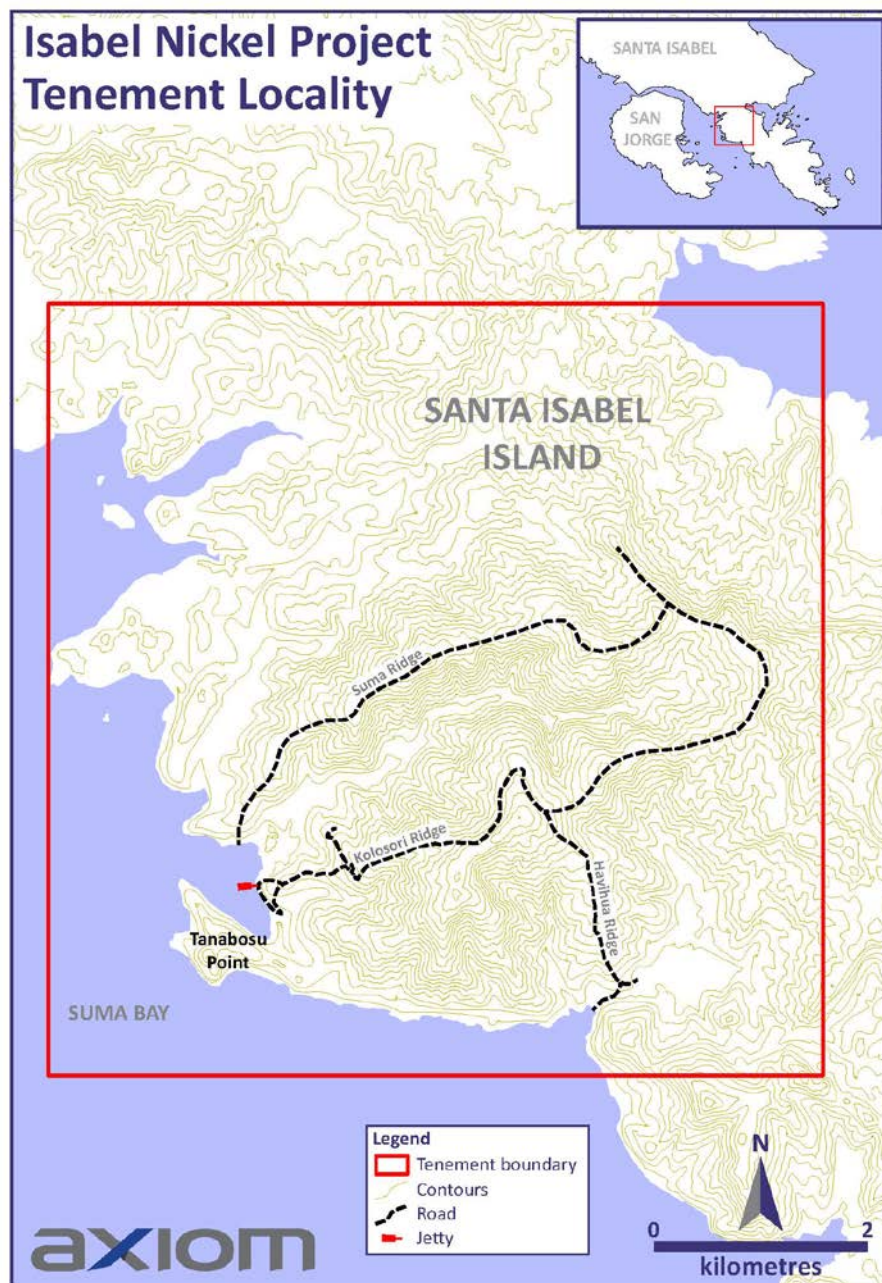
Figure 3 – Project tenement locality

Further drilling programs designed to facilitate mining operations will commence in June.