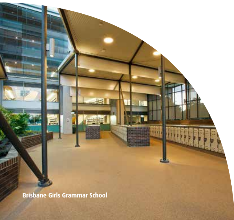
Brisbane Girls Grammar School

This major school upgrade project reached practical completion in February 2015 in readiness for commencement of the school year. Watpac was responsible for the design management, programming and construction of a new seven-storey building to deliver integrated teaching spaces, administration support facilities, and a new library facility. To operate in the constrained site area within a live school environment, Watpac established extensive processes and communication procedures to limit the project's impact on school activities.