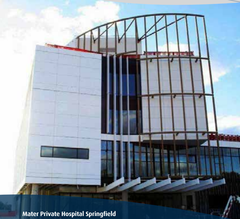
Mater Private Hospital Springfield