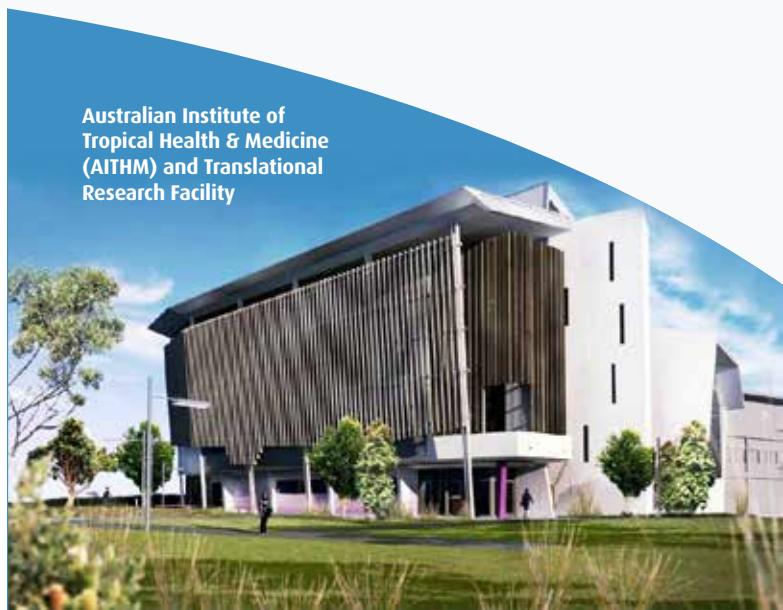
Australian Institute of Tropical Health & Medicine (AITHM) and Translational Research Facility

In December 2014, Watpac was awarded a contract to build the AITHM Tropical Health Research Facility in Townsville. The new world-class infectious diseases research facility will include PC2 and PC3 laboratories, a biological facility, specialist laboratory support spaces and offices. It will also house the Translational Research Facility, an approximately 1000 square metre building that will include offices, open plan workstations, conference facilities, consultant rooms and back of house facilities. Works are scheduled for completion in April 2016.