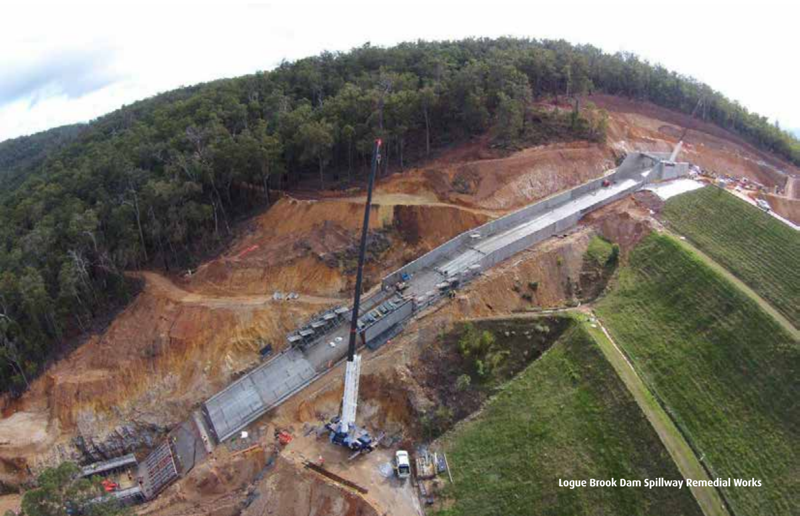
Logue Brook Dam Spillway Remedial Works

Watpac is delivering two satellite projects for Iluka Resources that will run in parallel with works the Group is undertaking at the Tutunup South Mineral Sands Mine. The first project is an iron concentrate harvesting contract that will run from November 2014 to May 2016. Watpac will harvest a number of dams containing iron concentrate, which will be dried out and stockpiled ready for shipping overseas. The second smaller project involves cleaning out one lined dam containing ironman gypsum at Iluka's North Capel site.