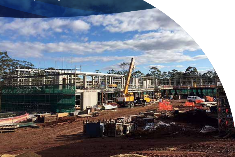
Charles Sturt University Campus – Stage 1

Works are progressing on Stage 1 of the new Charles Sturt University Campus in Port Macquarie where Watpac is delivering 5,700 square metres of education and research areas, built around a centralised courtyard, to accommodate more than 1,000 students and 100 staff. The campus will offer teaching and research areas, staff office accommodation, an Indigenous Student Centre, outdoor learning spaces, car parking for 350 vehicles and Port Macquarie-Hastings Council's Food, Soil and Water Testing Centre, a specialist research facility.