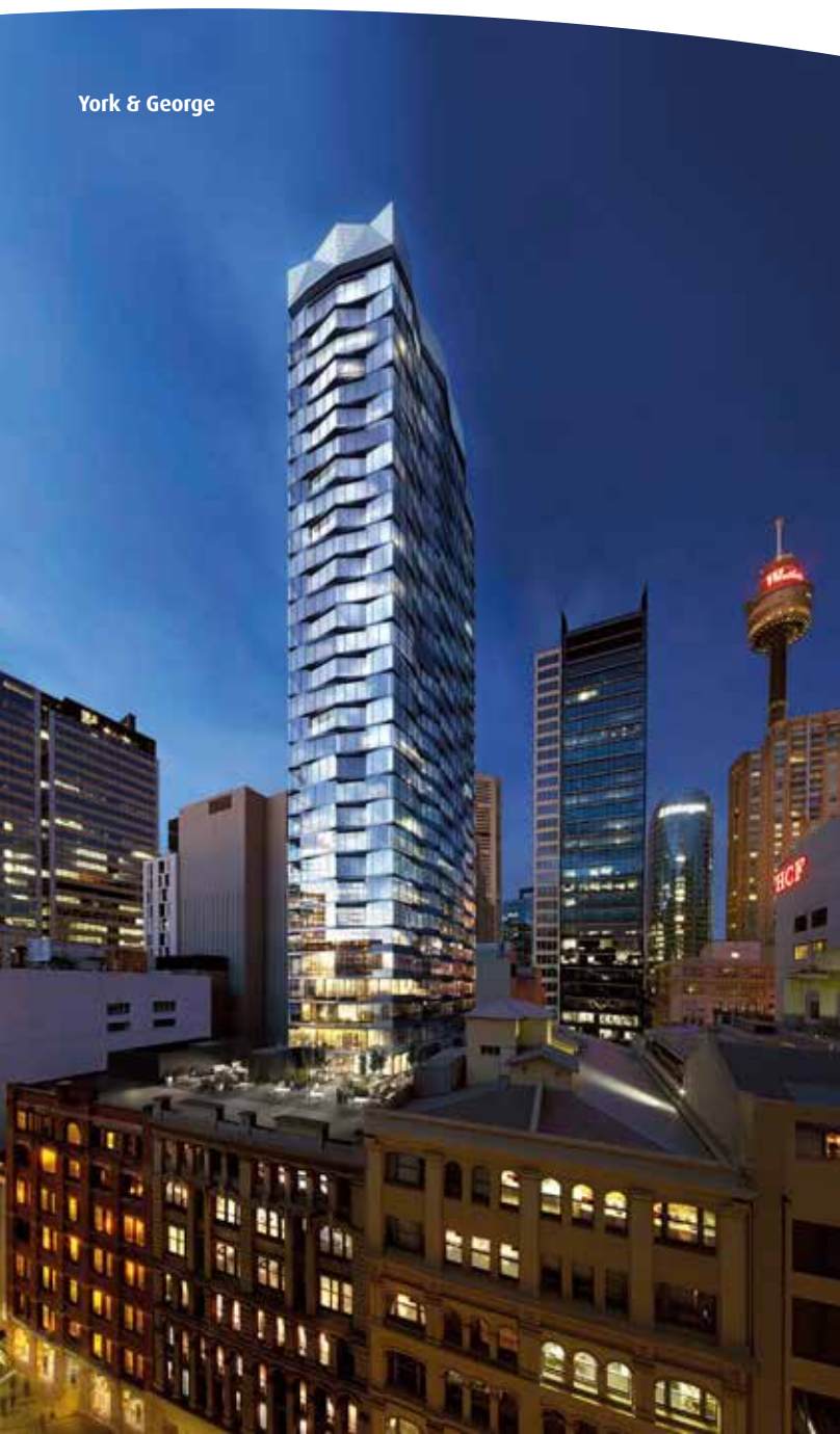
York & George

Works are progressing on the construction of this new state-of-the-art aged care and respite facility for Baptcare, located in eastern Melbourne. The project involves construction works for Stage 1C of the new facility including 120 new bedrooms with ensuites, staff offices, dining areas, leisure/sitting rooms, a hair salon, utility areas, laundry and a commercial kitchen. In addition, associated landscaping, access road and car park pavements will also be delivered. Site work commenced in October 2014 and is scheduled for completion in early 2016.