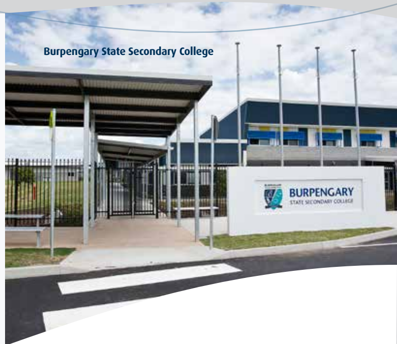
Burpengary State Secondary College

This major infrastructure program will see Watpac build 10 new schools for the Queensland Government as part of the Plenary Schools consortium. Watpac's component of the works program involves the design and construction of new schools in high growth regions of South East Queensland. The construction program is part of the State's $1.5 billion investment over the 30 year PPP concession term delivered in partnership with Plenary Group and Delta FM Australia. The five-year construction program commenced in January 2014 and is expected to create more than 3,000 jobs throughout the life of the project. Stage 1A works at Pimpama and Burpengary were handed over in October 2014 and stage 1B in December 2014. Construction at Pallara, Ripley, Caboolture West and Griffin has commenced with stage 1B completion due in December 2015.