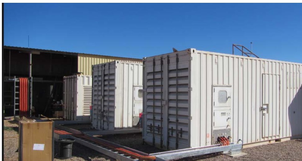
Power station now operational

The company intends to commence commissioning upon completion of the final refurbishment tasks in the coming weeks and expects first gold production in August 2015, as previously advised.