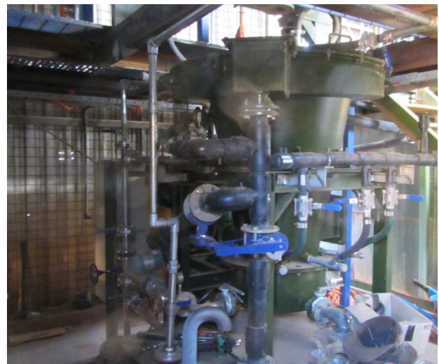
Crushing circuit including new secondary cone crusher and magnet, and Acacia Reactor installed in the upgraded gold room

The permanent power station has also been installed and commissioned, and is ready for commencement of operations.