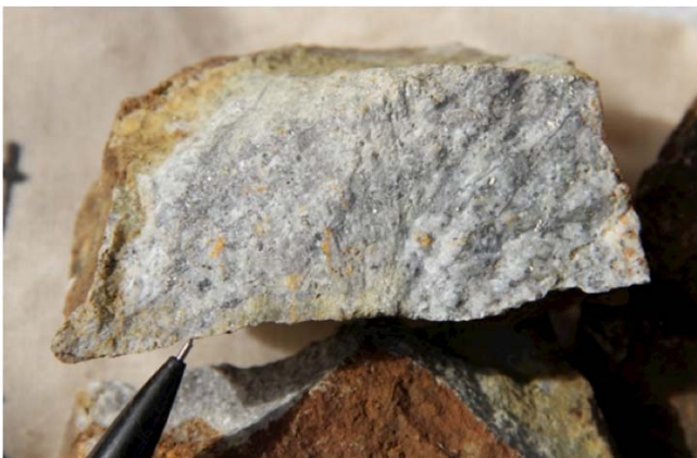
Picture 1 - Sample D016-1, 29.8grms/tonne Gold: From old working developed on narrow quartz-sulphide veins in the metasediments enclosing Hobbs Pipe. The existence of narrow, high grade gold zones in the overburden of the potential open cut portion of Hobbs Pipe will be investigated in further detail. Sample, quartz vein with arsenopyrite and pyrite

Sovereign Gold Company Limited, Telephone: +61 2 9251 7177