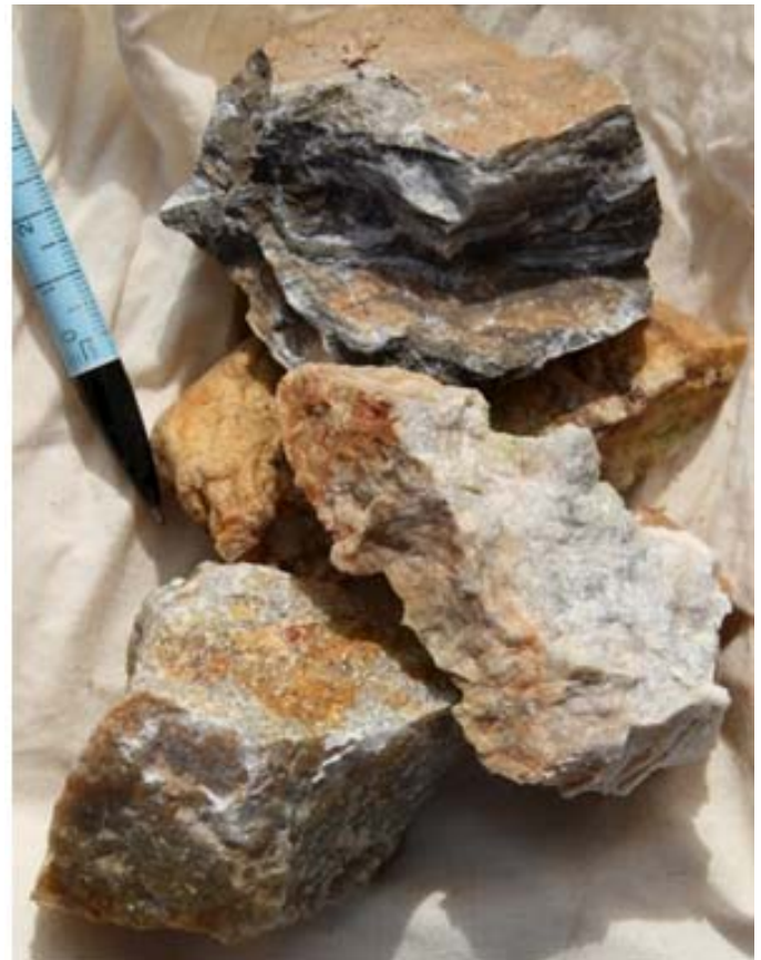
Picture 4 - Sample D025-1, 24.9gms/tonne Gold: Historic Mines Nacki Nacki Eluvial, Bangadang area. Float consisting of narrow quartz veining hosted in foliation of metasediments and fragments of quartz veins