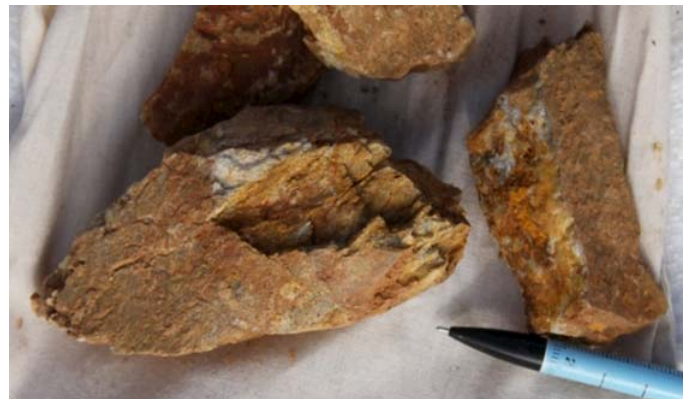
Picture 2 - Sample D033-1, 51.3gms/tonne Gold and 20.8gms/tonne Silver: Historic Mine Breccia Lode 3, Bangadang area. Sheared metasediment hosting sheeted quartz veins with yellow limonite staining after sulphides