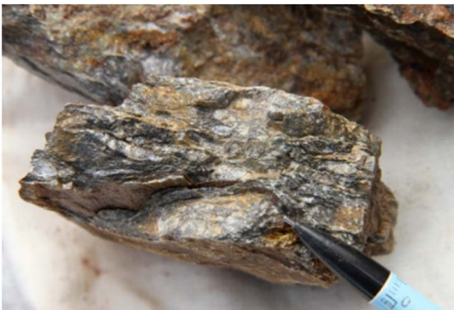
Picture 3 - Sample D028-1, 36.8gms/tonne Gold: Historic Mine Comedy King 2, Bangadang area. Discarded float consisting of narrow quartz veining hosted in foliation of metasediments.