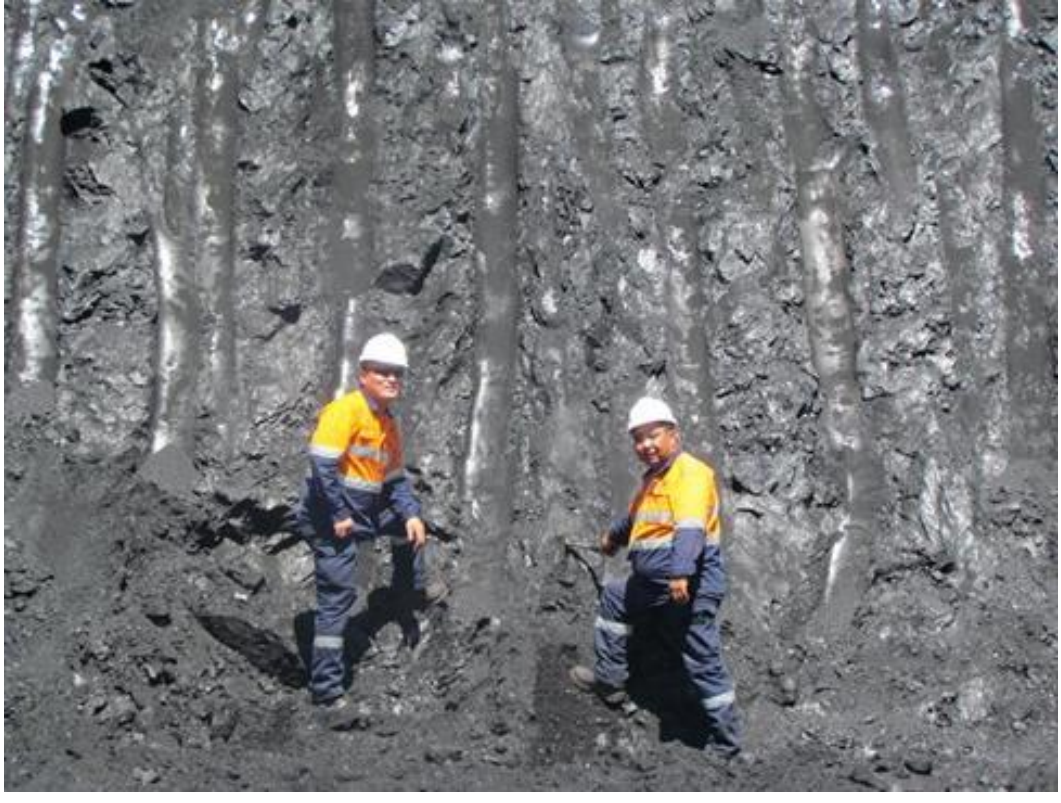
Quarter 4 Report June 2015