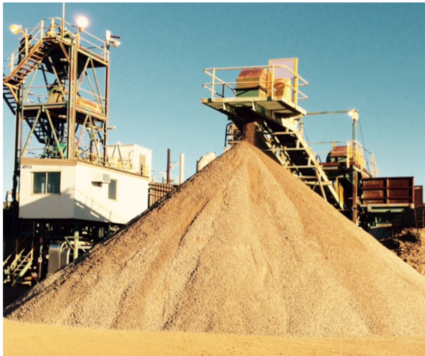
Crushing underway at Nicolsons

Commissioning of the Nicolsons processing plant is underway, with all components tested and operating as expected. Approximately 1,200 tonnes of low-grade material has been crushed and stockpiled, and will be processed in the ensuing days.