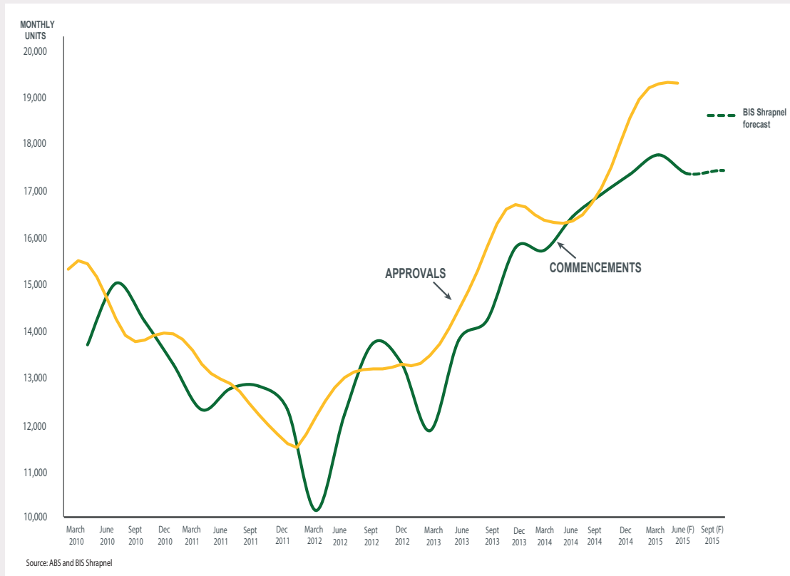
MONTHLY DWELLING APPROVALS AND QUARTERLY DWELLING COMMENCEMENTS