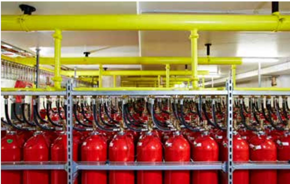
Inert gas fire suppression system (S1)