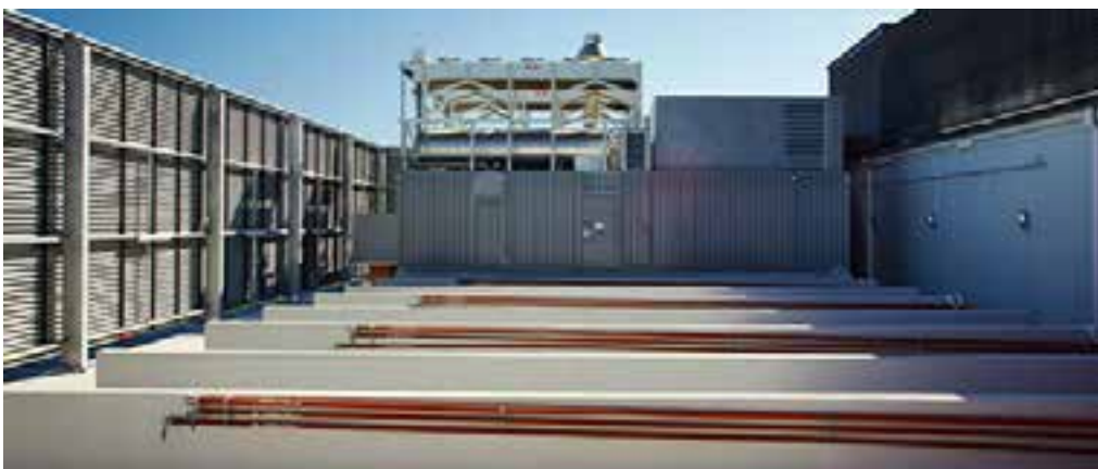
Containerised Piller DRUPS units and future expansion space (P1)