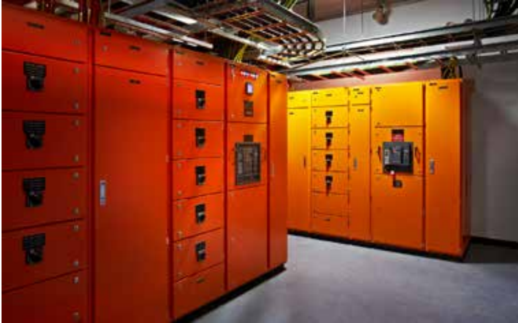
High Voltage switchboard (B1)