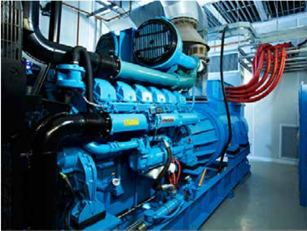
Perkins V12 diesel engine at the S1 data centre – part of a Piller DRUPS unit