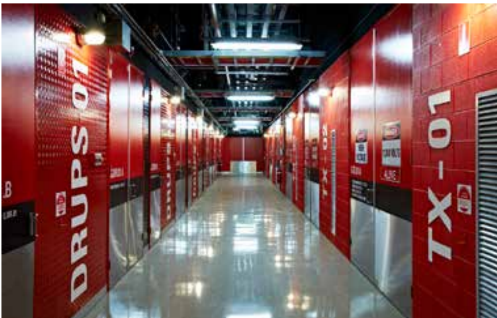
Diesel Rotary UPS corridor (M1)