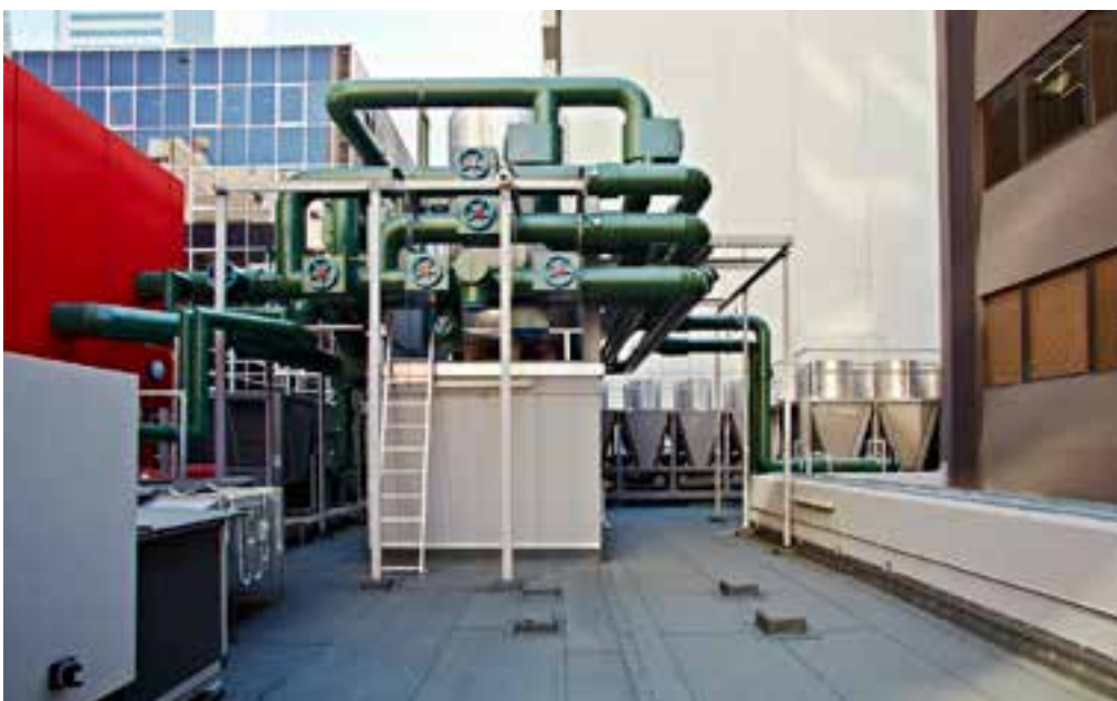
Air-cooled UNIFLAIR chillers and water storage (B1)