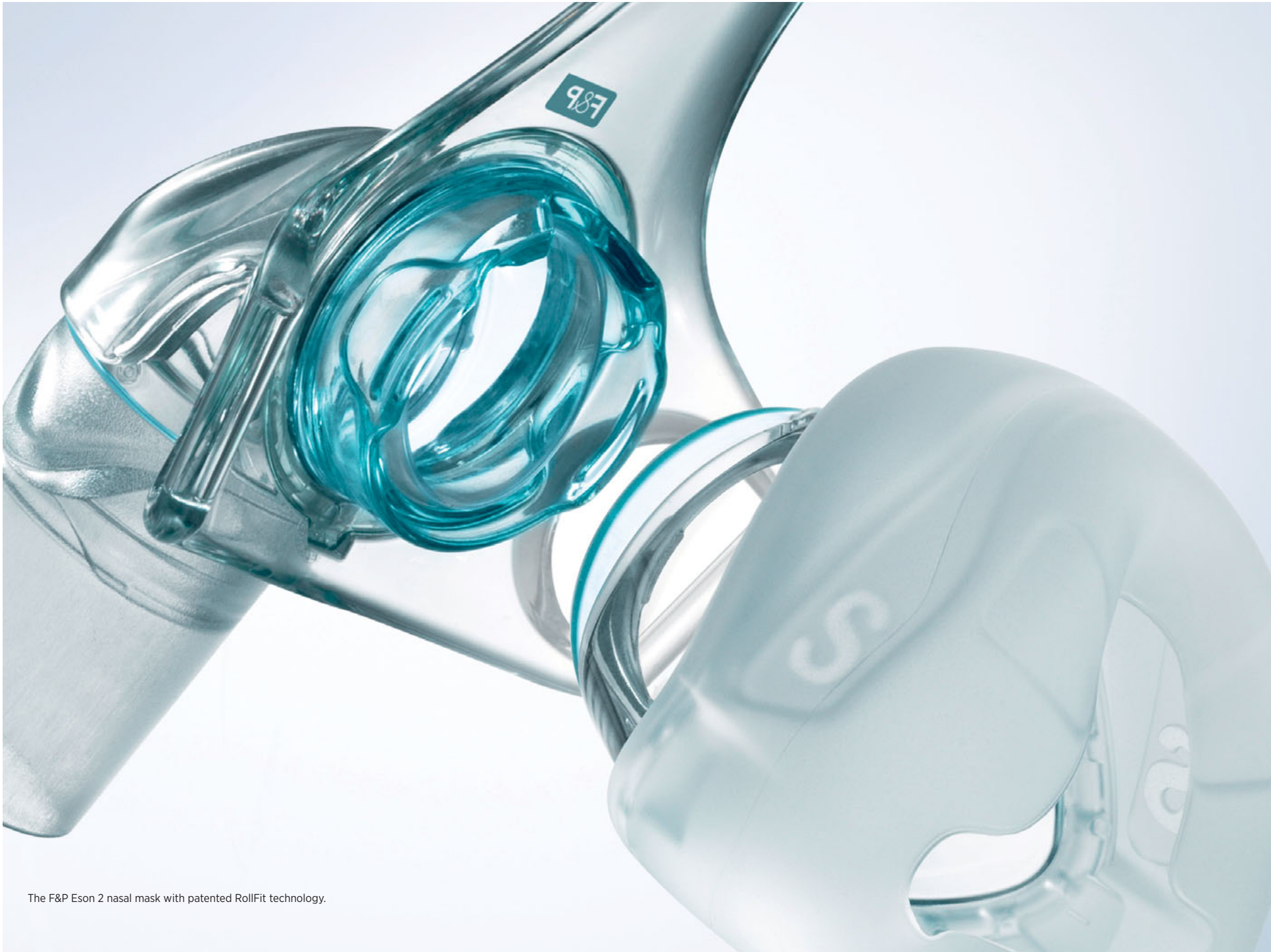
The F&P Eson 2 nasal mask with patented RollFit technology.