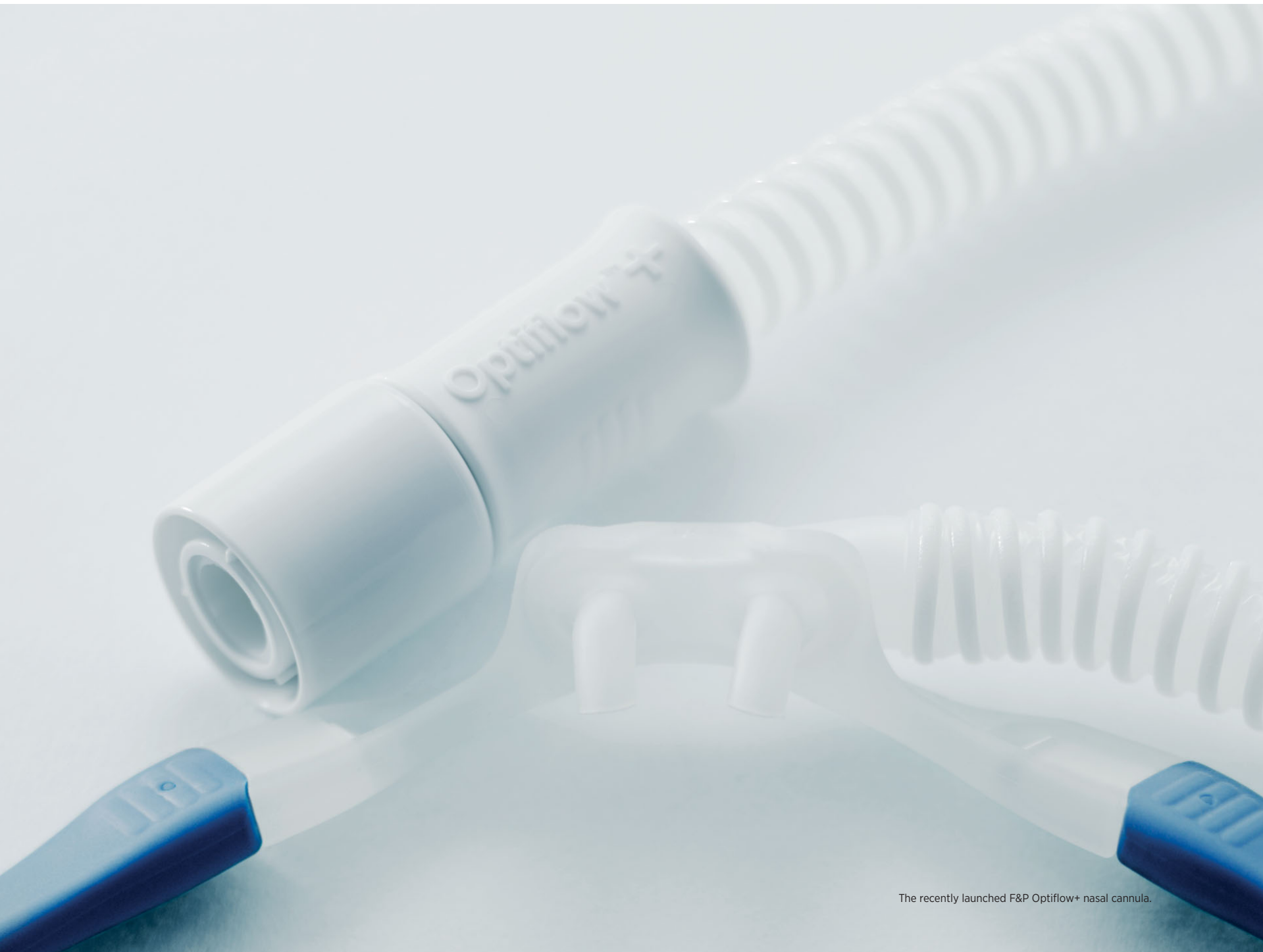
The recently launched F&P Optiflow+ nasal cannula.