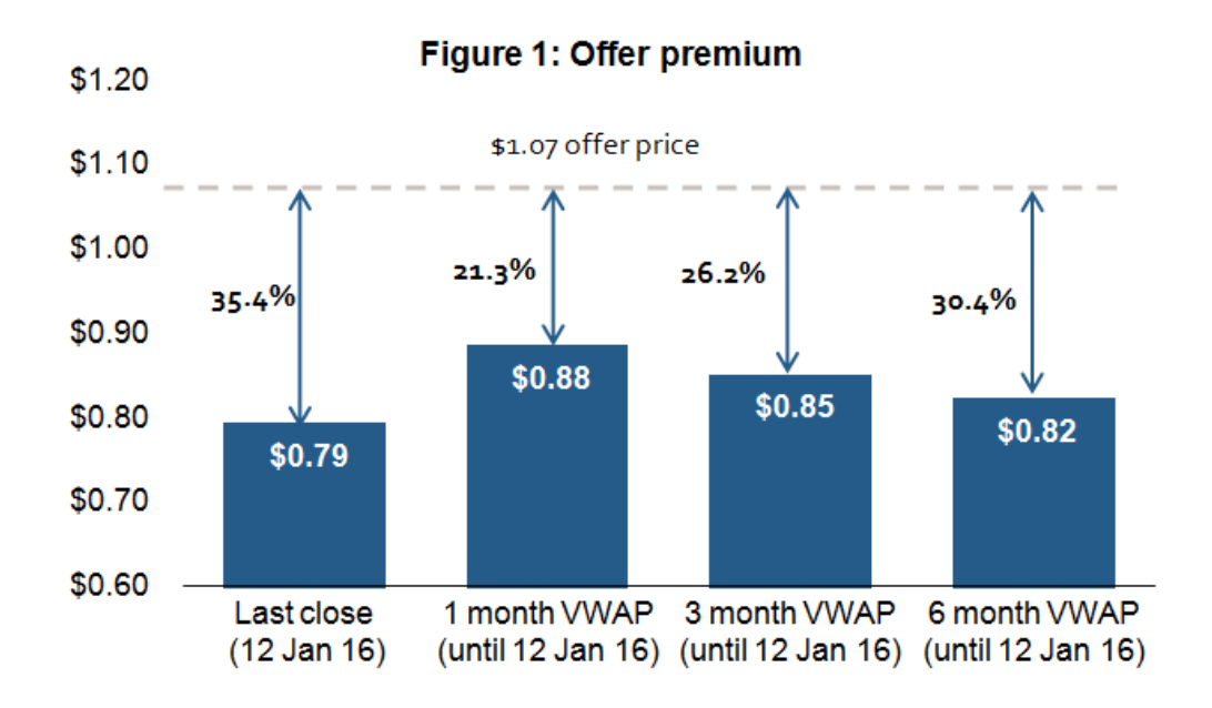
Figure 1: Offer premium*

Furthermore, CIMIC considers these premia to be particularly attractive given Sedgman's significant net cash balance<sup>4</sup>.