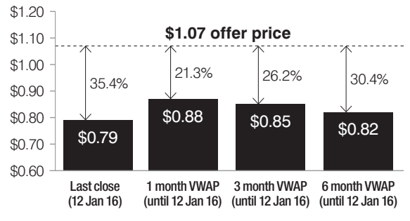
Figure 1: Offer premium*

*  As permitted by ASIC Class Order 07/429, this chart contains ASX share price trading information sourced from IRESS Limited without its consent.