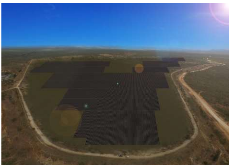
Figure 1: Illustrative concept design of the Kidston Solar Project

Genex Power Limited ( Genex or the Company ) is pleased to advise that its Feasibility Study (FS) for the first 50MW stage of its Kidston Solar Project is now well advanced and on track for completion in 2Q 2016. Alongside the feasibility study, a competitive tender process was being run to tender for engineering design, procurement and construction (EPC) of the initial 50MW Stage One of the project.