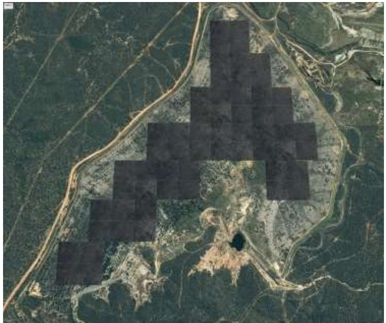
Figure 2: Illustrative concept design of the Kidston Solar Project (alternate view)

The capital costs for the first 50MW are in line with expectations and confirm the potential for attractive project returns.