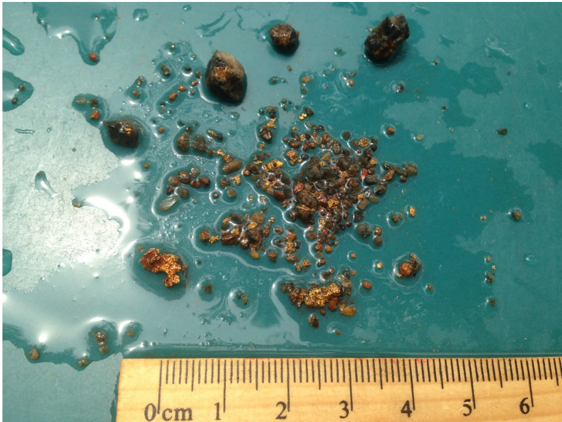
Figure 3: Photograph of visible gold nuggets up to 6mm length and black ferruginous quartz fragments from RC drilling between 12 and 17m in drill hole DMRC003. Note: The gold shown above was from 2 handfuls of sample from each 1m sample which was sieved to produce the coarse fraction (no sample from the cavity therefore 4m in total). Each metre of sample had traces of gold.

All significant zones of mineralisation identified in the shallow RC drilling programme where the drilling contract allows 6 metres of fresh rock at the end of hole to identify dominant lithologies before stopping the hole will be followed up with conventional RC drilling down to depths exceeding 100m.