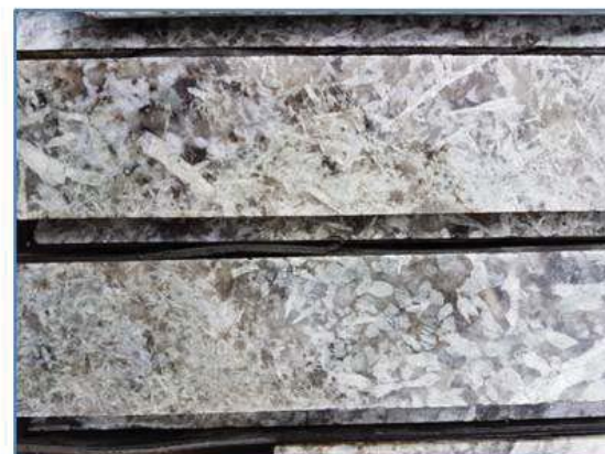
Figure 1. Diamond drill core from Goulamina.