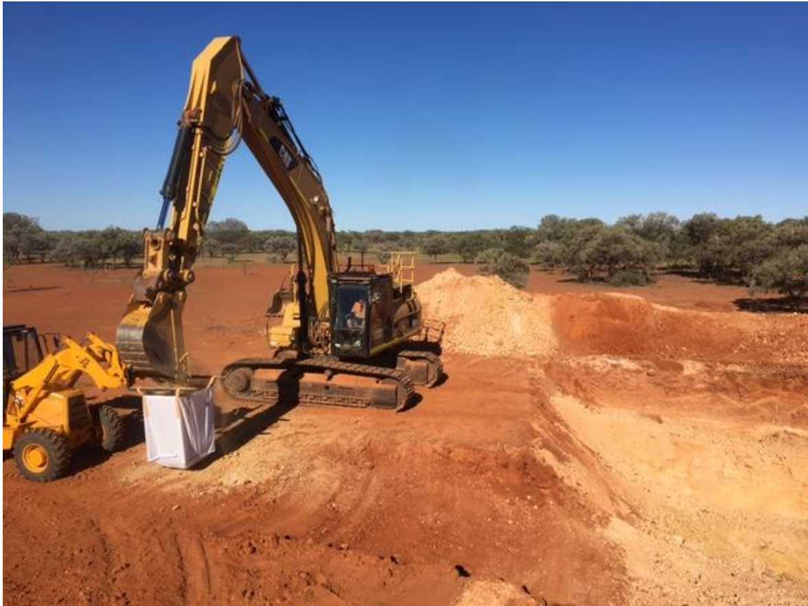
Loading a 1 tonne bulka bag from the same site as above.

A handwritten signature in black ink, appearing to read 'Chris Tziolis', is positioned above the name and title.