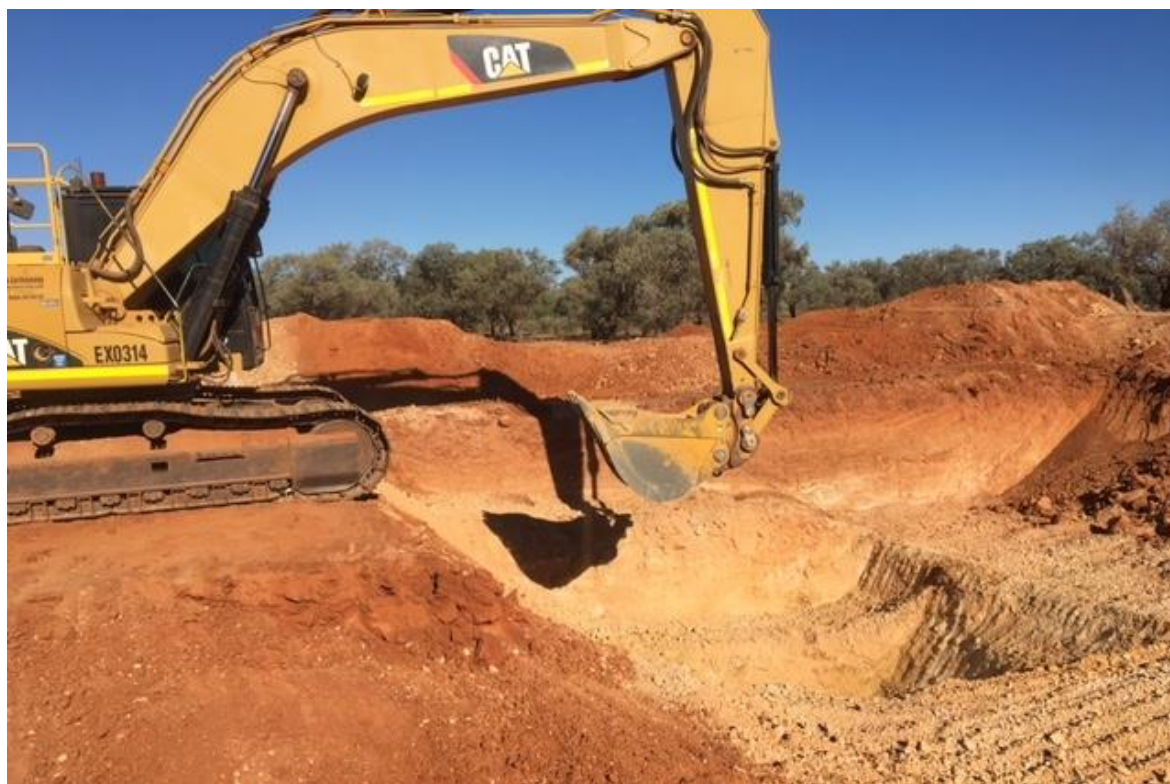
Excavation of 2016 Sample 2 at the site of drillhole ARC647. The pale, beige material is shallow phosphate.