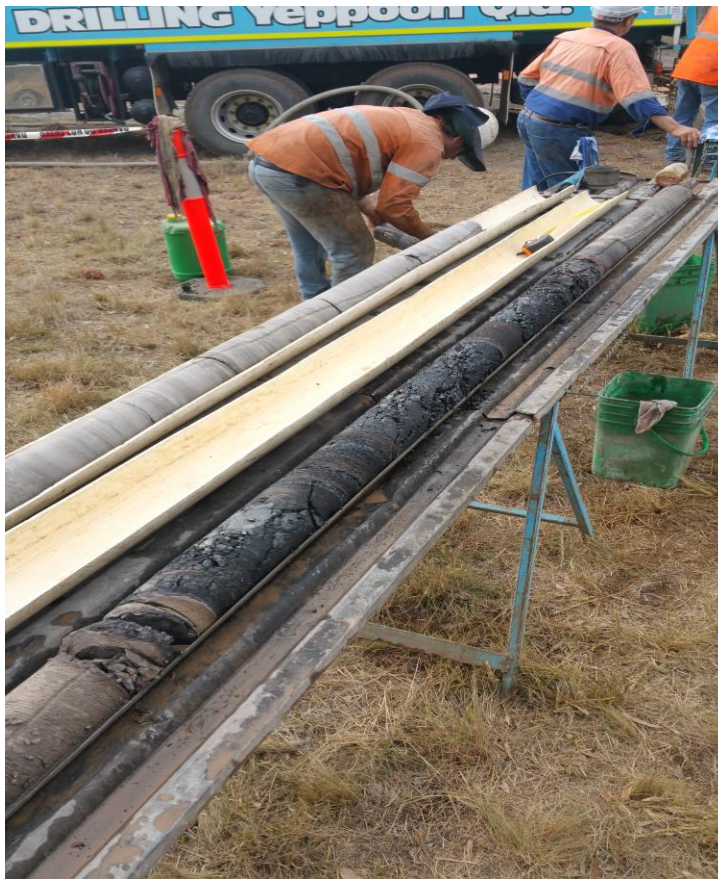
Figure 3 Bulwer coal seam from WK 16C