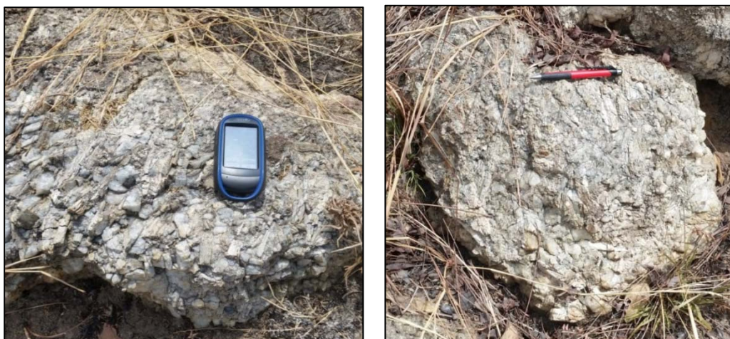
“Crowded” spodumene rock at Goulamina

Processing test work has confirmed the viability of the pegmatite at Goulamina to produce a high quality chemical grade lithium concentrate . Test results show good spodumene (lithium) recoveries (84.7%) and high mass yield to produce a high quality, chemical grade (6.7%) spodumene concentrate . For reference, concentrate grades of 6% are typically demanded by global lithium carbonate producers.