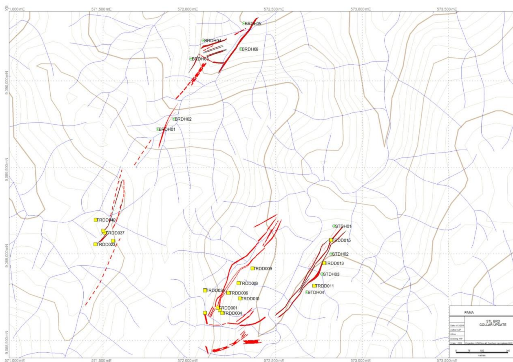
Figure 3: Buluroto & Sentul Prospects – Drillhole Location Plan (Note: The TRDD hole ID's are previous ARX holes drilled in 2010/11)