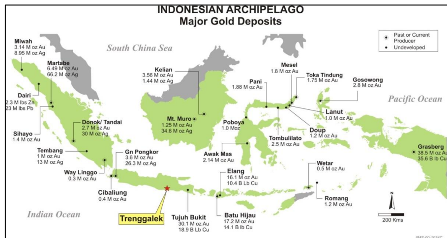
Figure 1. Trenggalek Project location & major gold and base metal deposits in Indonesia

ARX is exploring for gold and base metal deposits along Indonesia's highly prospective magmatic arcs and associated geological terranes (Figure 1). The primary exploration targets are high-grade epithermal gold-silver veins and porphyry-related copper-gold deposits.