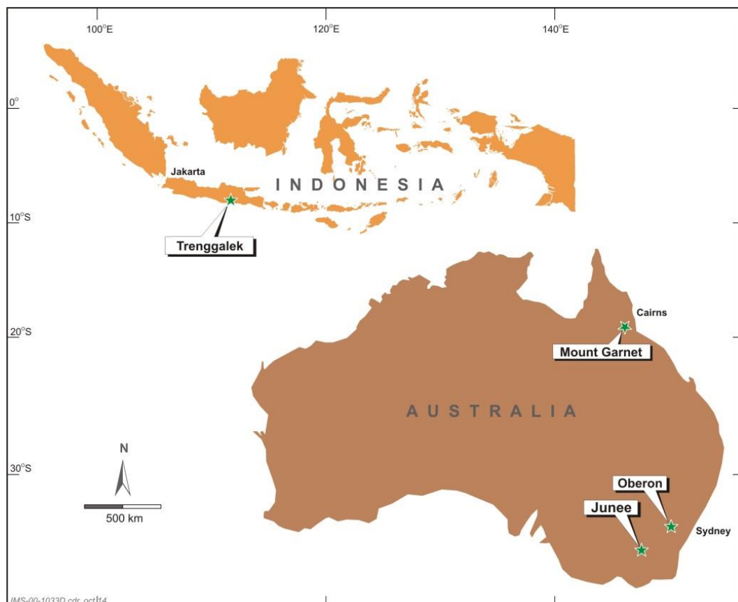
Figure 4. Australian and Indonesian Project Locations

To conserve funding, ARX exercised its right under Farm-in agreements with New South Resources Pty Limited dated 1 August 2014 to withdraw from the Junee and Oberon projects located in New South Wales, effective from 13 th April 2016 (see ARX Announcement dated 14 March 2016).