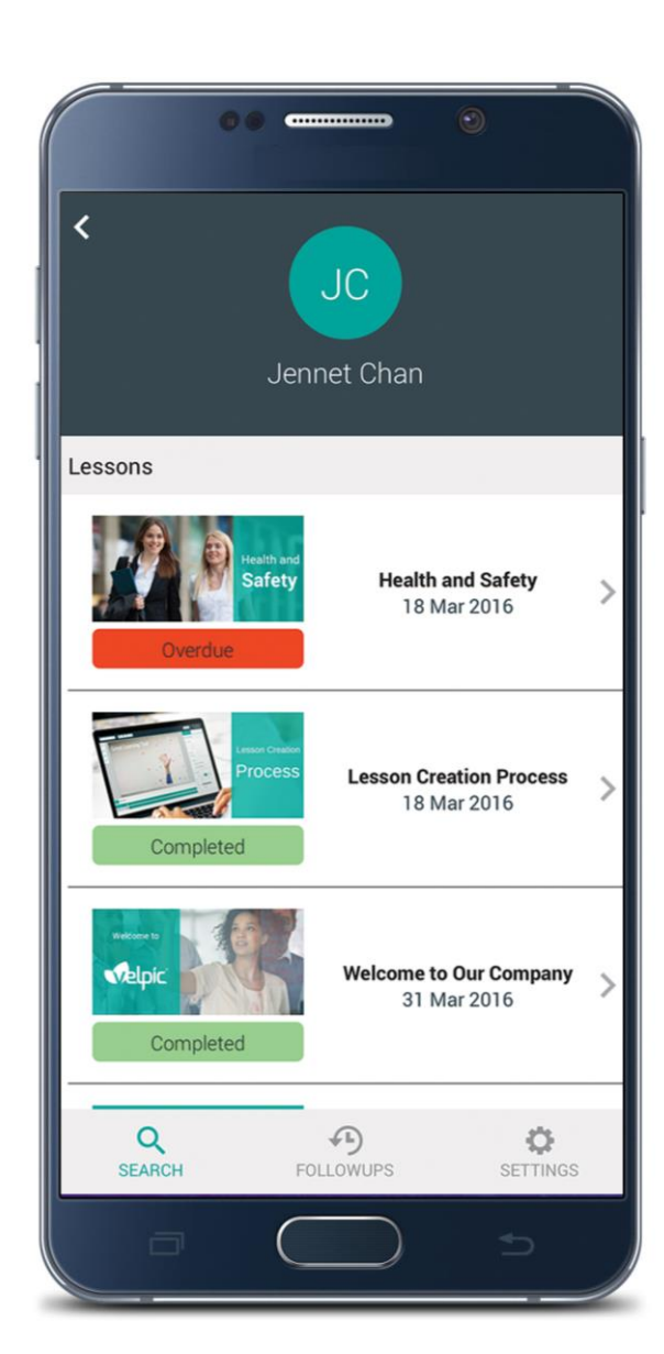
Figure 1: Screen shots of Velpic's first native app on both iOS and Android. The Velpic Supervisor app is designed to provide a variety of training administration functions via a smartphone.