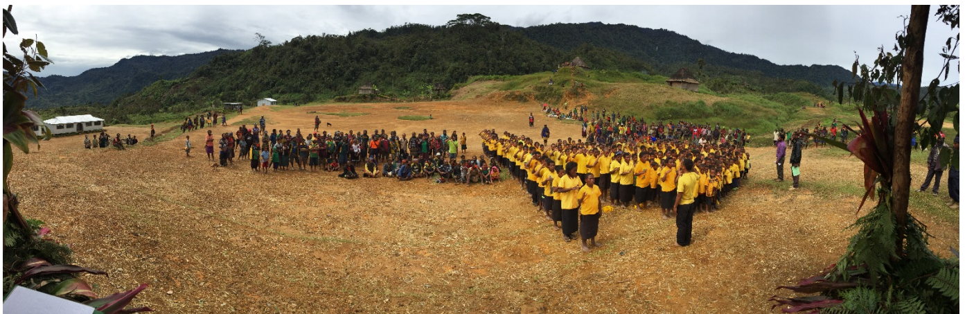
Local Support at Keman Village Warden Hearing EL 2426