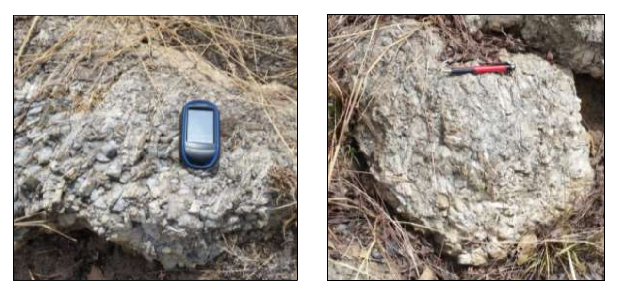
Coarse grained "crowded" spodumene rock at Goulamina