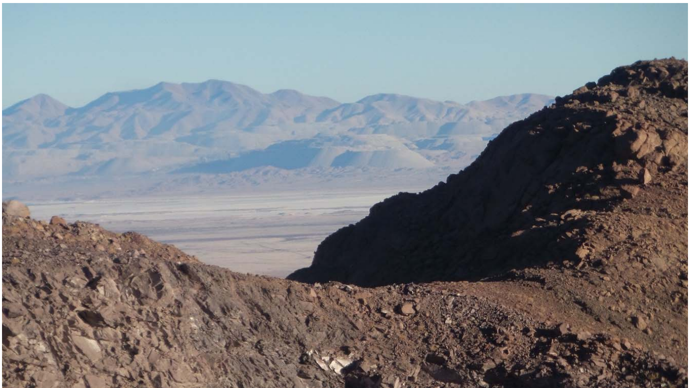
View of Chuquicamata Mine dumps from Tuina