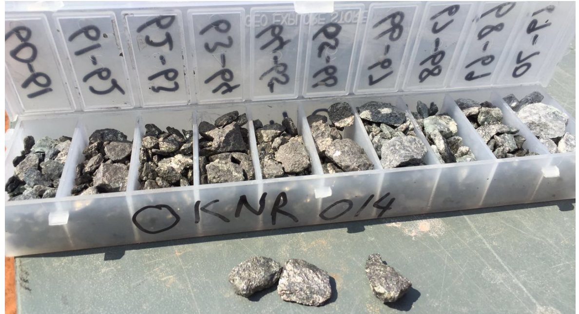
Figure 1: Massive sulphides in OKNR014 between 60 m and 70 m (left to right). Note each divider shows chips from a 1m interval.

A total of 14 historical diamond core holes for 3,199m were drilled at the Kantienpan Deposit by Iscor Ltd (Figure 2). Significant intersections include the following results: