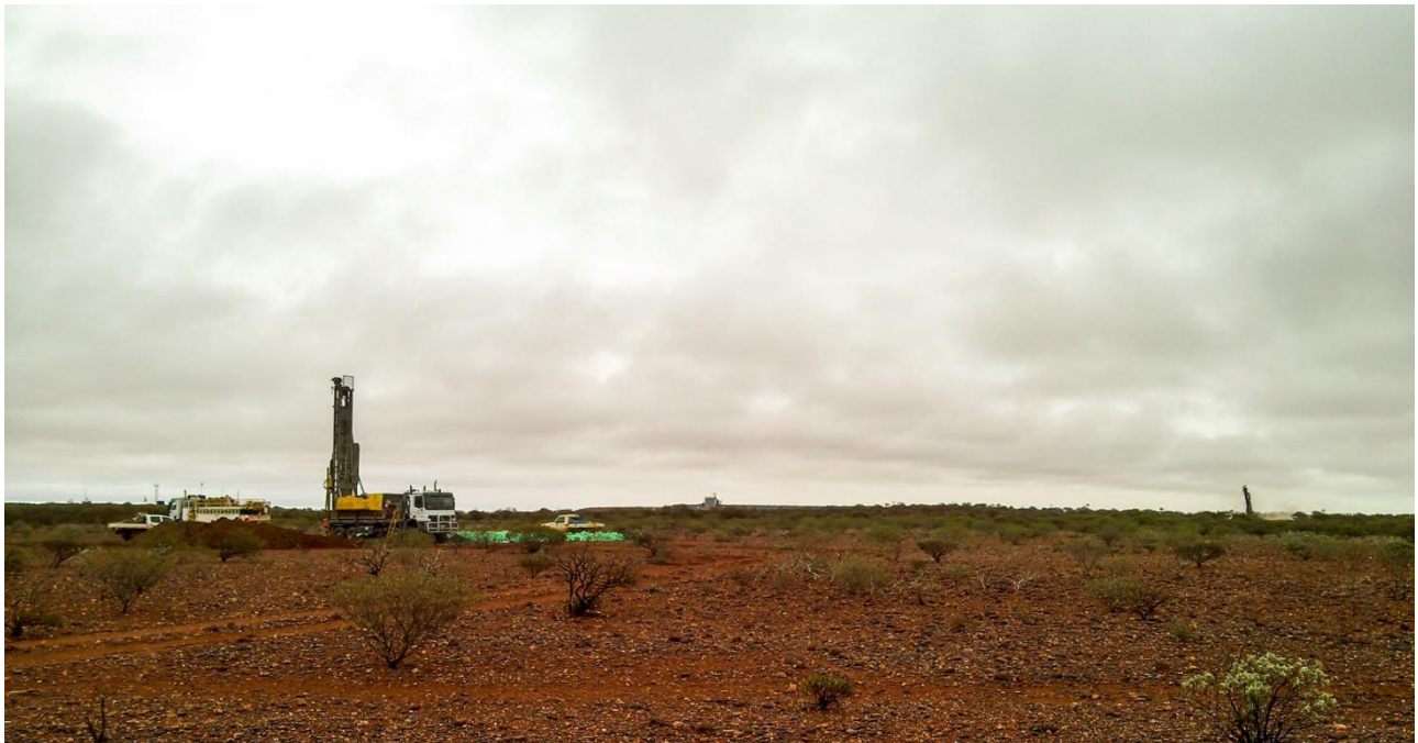
Figure 1. RC drilling at Tepes target, Red Bore. Note Sandfire rig at right, close to the northern boundary of the Red Bore tenement; and Sandfire's DeGrussa plant infrastructure in the background at centre.

The Doolgunna area is currently a hot-bed of exploration activity, with Thundelarra's RC and diamond drilling at Red Bore; Sandfire drilling to the north and east (Figure 1); and RNI drilling to the south.