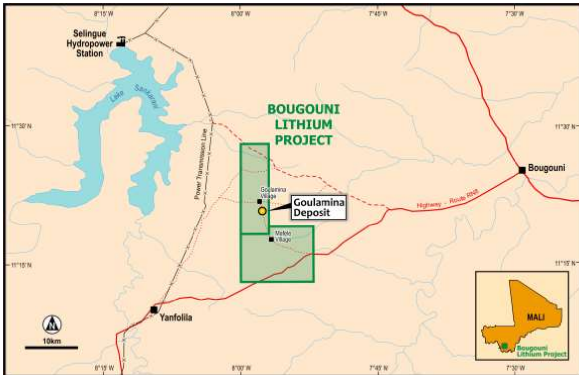
Figure 3. Goulamina Location and Infrastructure.