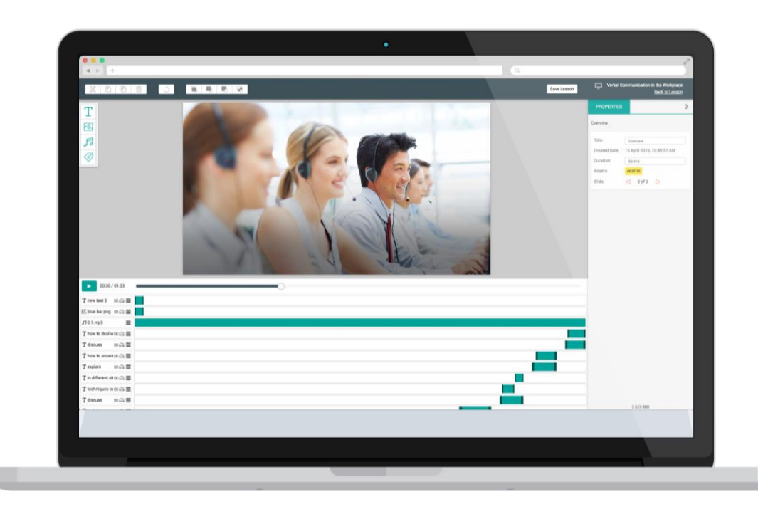
A suite of new authoring tools will enhance client experience in Version 3.0

Velpic will continue to generate revenue from all clients via a monthly subscription fee for providing access to its eLearning platform and professional service fees where requested for implementation. Pay Per View (PPV) fees for each lesson completed will only be applicable to Enterprise clients as the new SME pricing includes a monthly limit of lessons.