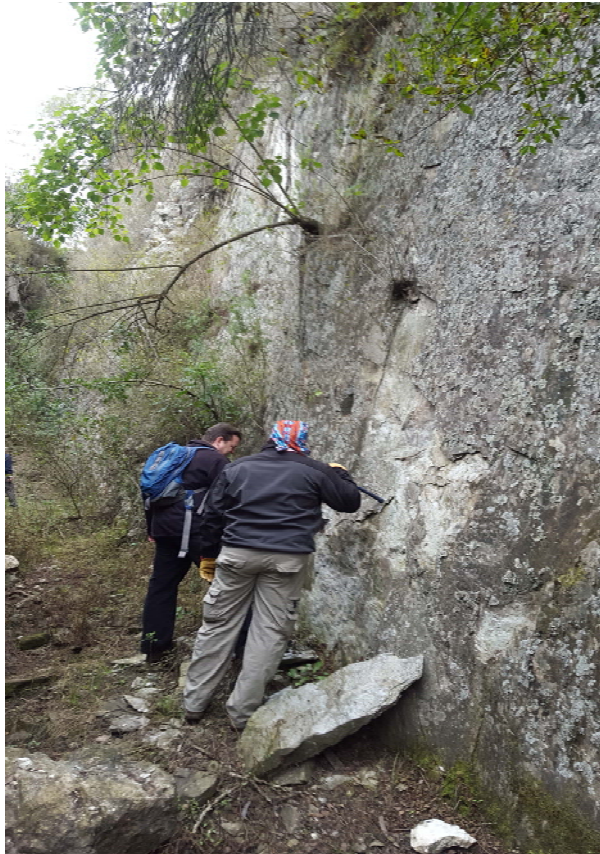
Inspection of wall rocks in old workings at the “Reflejos del Mar” Deposit.