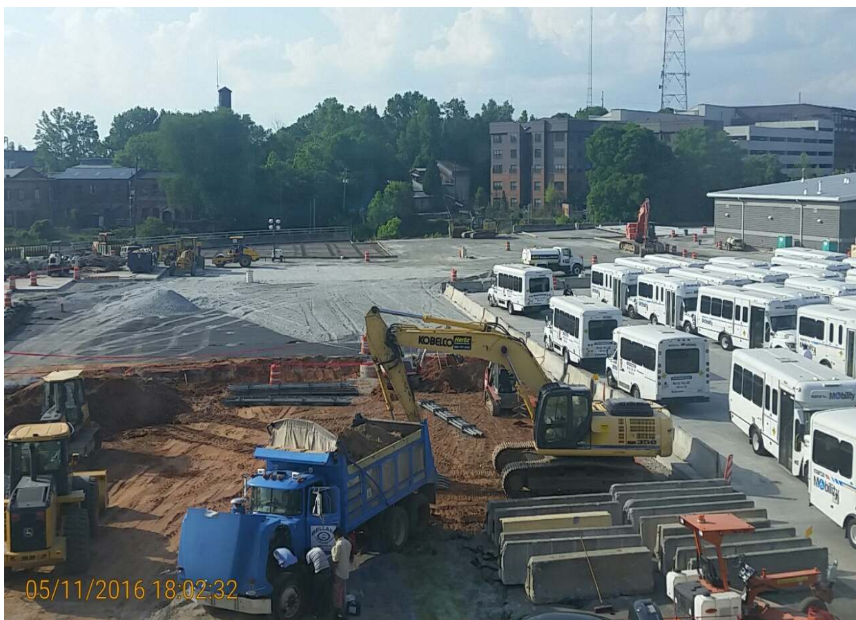
Figure 1. Brady Mobility Facility with EdenCrete™ slab site being prepared (shown in upper left)

A section of a new concrete hardstand area was installed using EdenCrete™ enriched concrete at a new state-of-the-art bus garage that is being constructed at the new MARTA Brady Mobility facility on the site of the existing bus garage (see Figure 1).