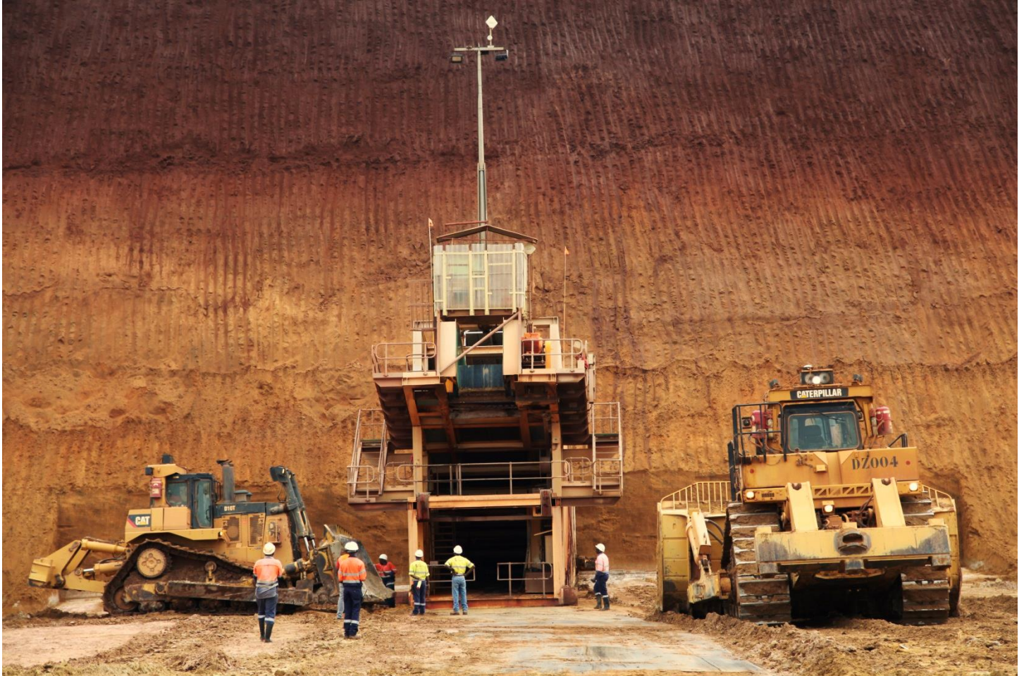
Dozer trap mining unit being moved to a new high grade block in the Central Dune

Mining operations continued in high grade zones of the Central Dune during the quarter, resulting in increased heavy mineral concentrate (“HMC”) production, up from 209,787t in the prior quarter to 226,453t. A 400tph hydraulic mining unit (“HMU”) will be introduced in the September quarter and will allow concurrent mining of high grade ore with the existing dozer trap mining unit (“DMU”) and allow access to lower grade perimeter blocks more cost effectively utilising the HMU. As a result, the blended average ore grades are expected to be lower in coming quarters.