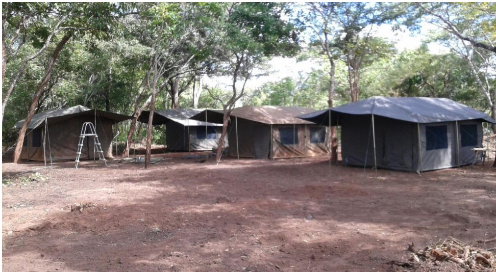
Figure 2. Montepuez exploration camp