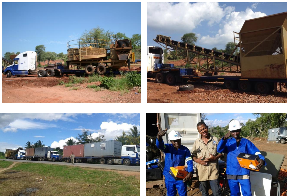
Figure 1. (i. and ii.) Processing equipment mobilised to site (i.) 16-foot pan and (ii.) feed-bin and conveyor belt (iii) trucks arriving & (iv) PPE Gear hand-out

Mustang has also begun setting up the processing plant in preparation for the commencement of bulk sampling in Q3 CY2016. The design and layout of the project and positioning of the processing plant, incorporates a number of strategic advantages, including minimising trucking distances, which saves on both time and diesel expenses.