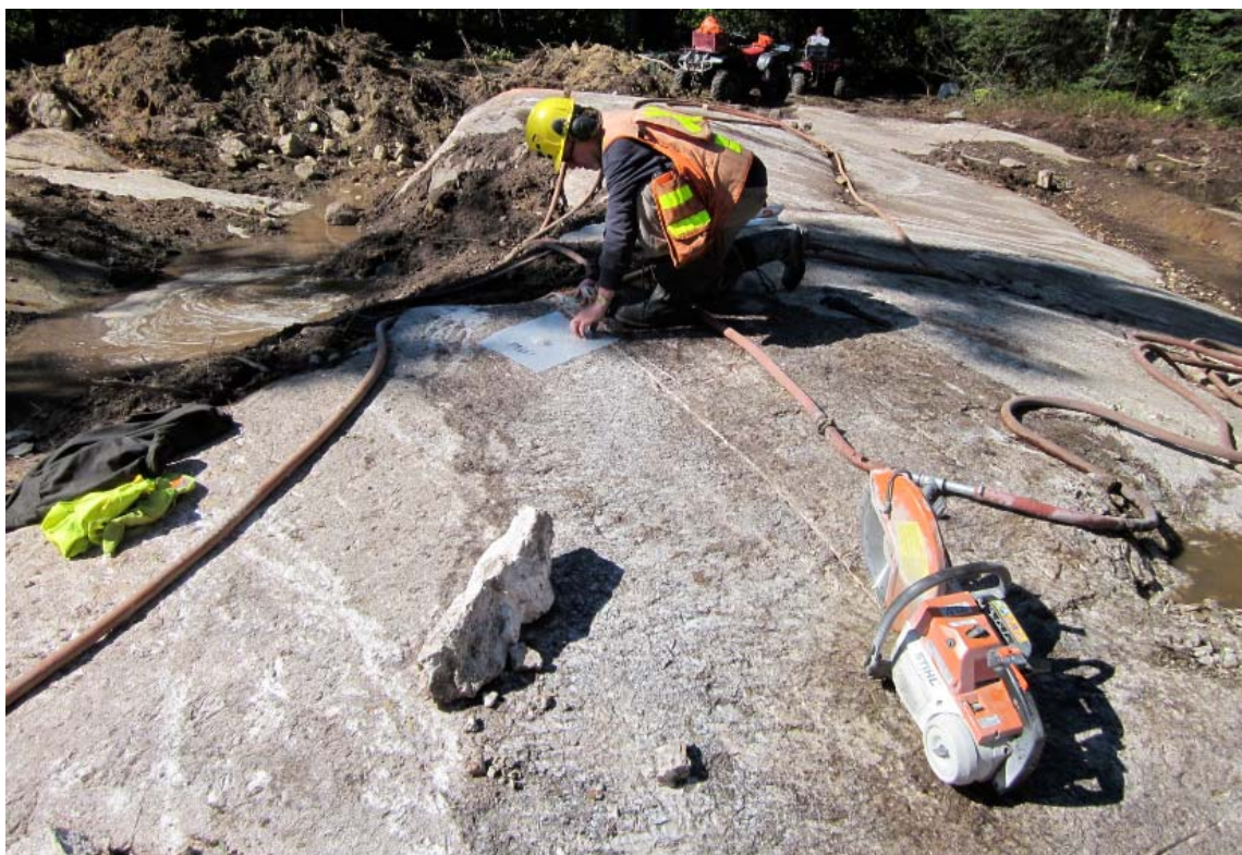
Dempster L61 (L6100W) deposit, channel sampling surface exposures after stripping and washing to expose the lithium-bearing pegmatite, walk-up drill target