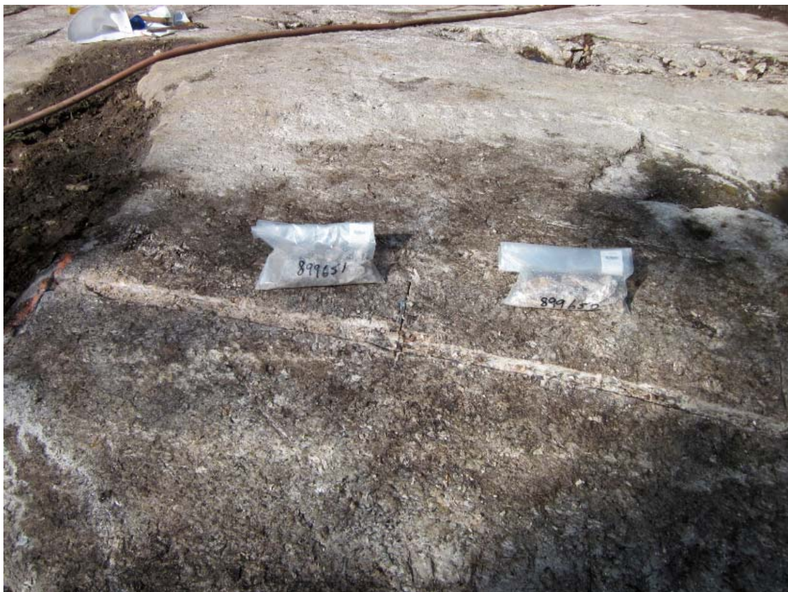
Dempster L61W (east dyke) deposit, channel samples of lithium-bearing pegmatite prior to dispatch for assay