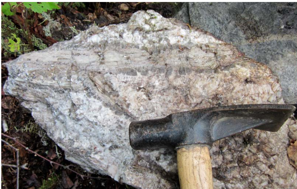
Dempster L61 (L6100W) pegmatite. The large rectangular elongated minerals are Lithium-bearing Spodumenes.