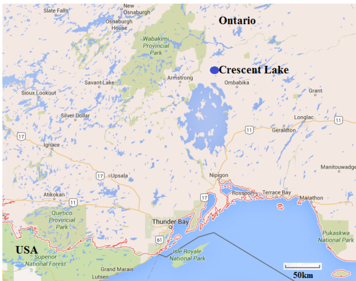
Figure 3: Regional Location, Crescent Lake is situated in the northeast portion of the Sovereign Claims above the four lithium-bearing pegmatite deposits.