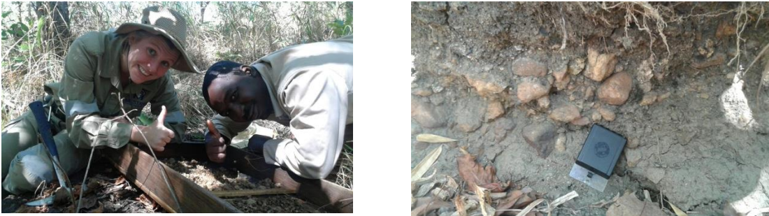
Figure 1. Mustang geological team doing field mapping

Furthermore, the Company is finalising a detailed review of all exploration data received to date on our Balama Graphite Project, with the aim of commencing a low-cost resource definition program in the second half of the year. An update on the Balama Graphite Project will be provided to shareholders shortly.”