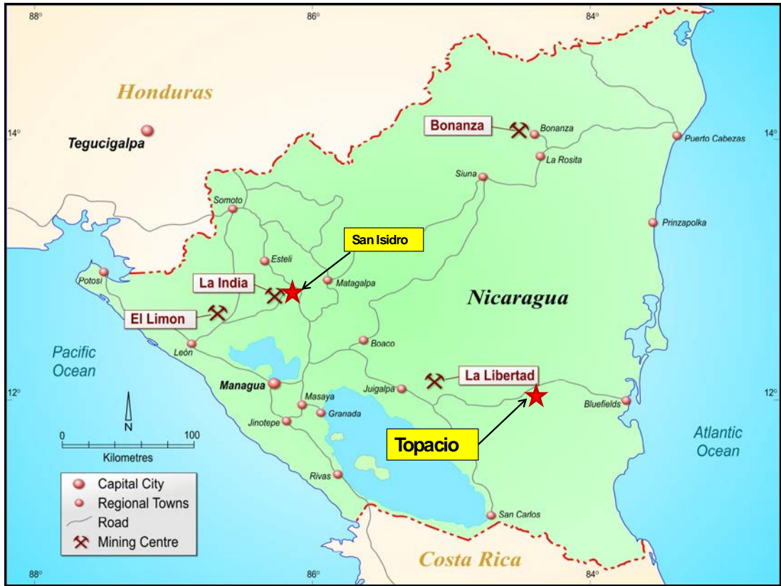
Figure 1 Major Nicaraguan gold deposits and the Topacio Gold Project