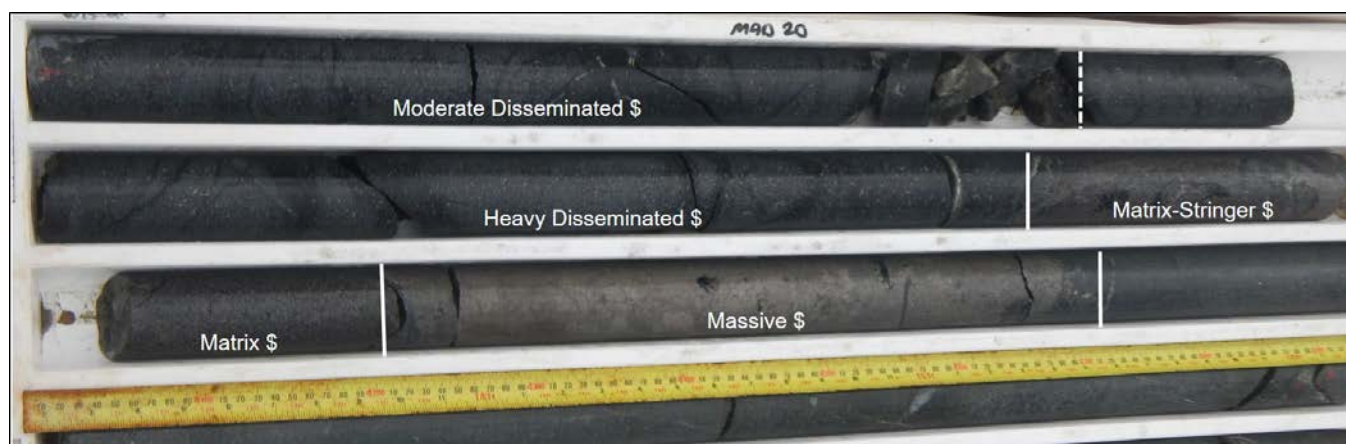
Figure 1 – photograph of drill core from MAD20. Gradation of moderate to strong disseminated sulphide mineralisation into matrix and then massive sulphides, hosted in ultramafic on contact with mafic (amphibolite).

MAD22 was completed to a downhole depth of 138.9m and intersected approximately 4.7m of ultramafic-hosted sulphide mineralisation from 49m to 53.7m which comprises: