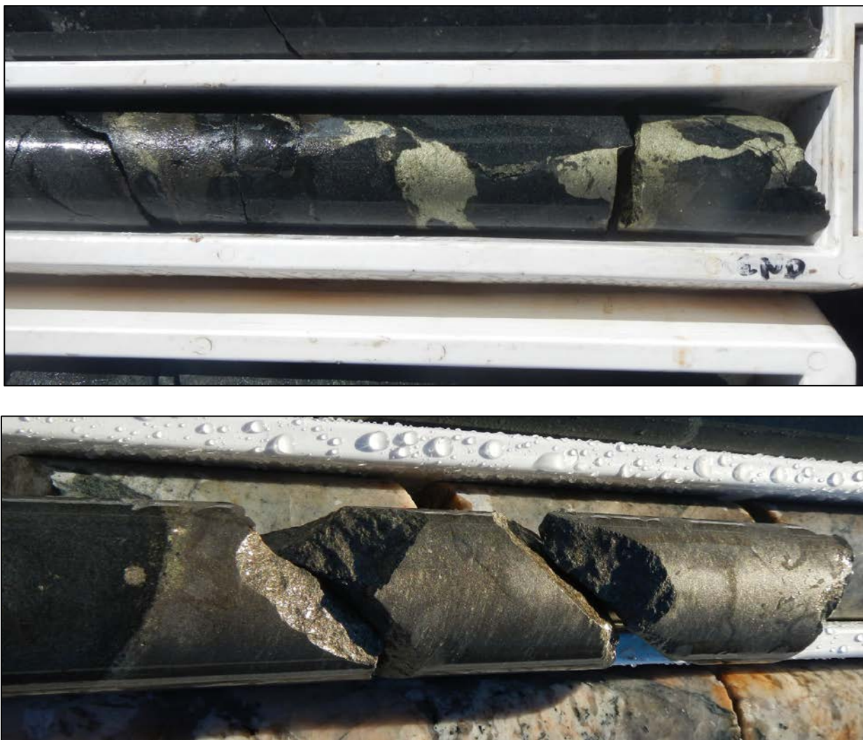
Figure 3 – photograph of drill core from MAD22 (top) and MAD23 (lower). MAD22 core shows chalcopyrite-rich stringer sulphides from 52-52.5m. MAD23 core shows massive nickel-copper sulphides from 57.45-57.7m that average 2.3%Ni, 5.1%Cu (based on field XRF analysis).

The Investigators area has never been explored and new access tracks will be completed by St George to allow a drill rig to mobilise to this site. Drilling at Investigators is likely to start in late June/July 2016.