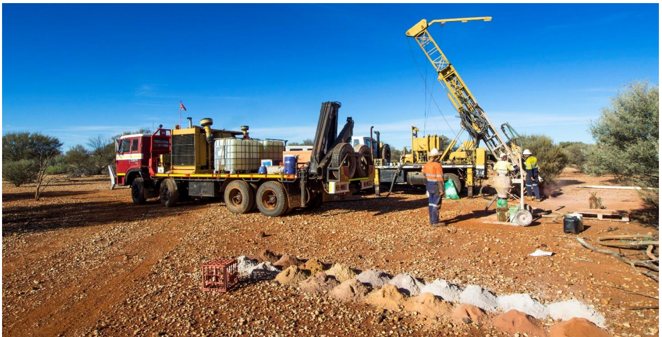
Figure 1. Drilling at North Granite Well Prospect, Garden Gully project.

This initial scout drilling programme at Garden Gully was designed to develop an understanding of the local geology and structure in order to help identify targets for subsequent more detailed, deeper follow-up drilling. Not all holes were able to achieve target depth due to a number of factors, but this did not prevent the programme from being an outstanding success.