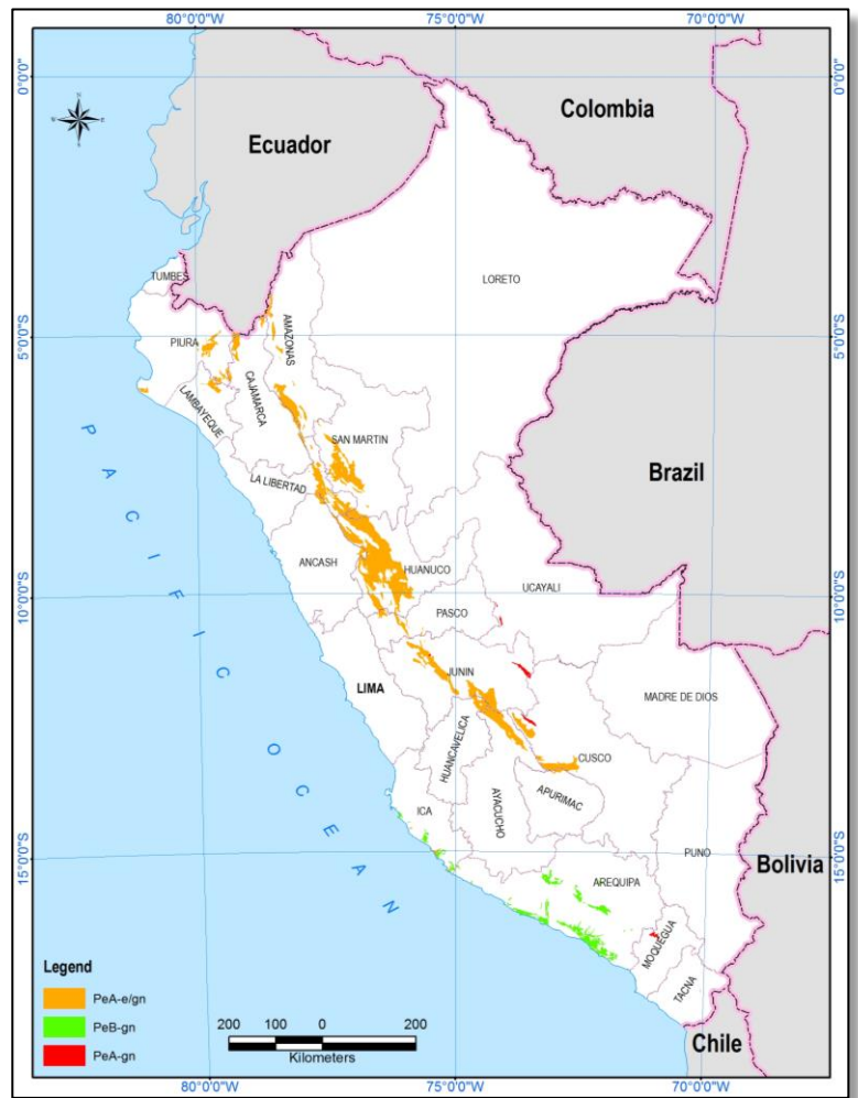
Figure 4 – Precambrian Gneiss Belts in Peru