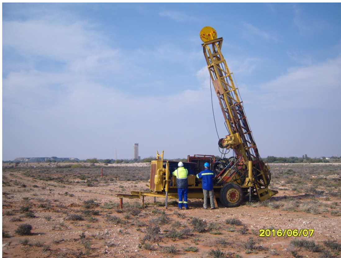
Figure 1: Drilling rig at PC Project with the historical Prieska Copper Mine in background.

Drilling will concurrently be carried out at the PC Project to focus on near-surface mineralisation at the Company's +105 Level Exploration Target (Refer Table 1 and ASX Release 18 November 2015). The upcoming drilling will in-fill and validate historical drilling which returned results including: