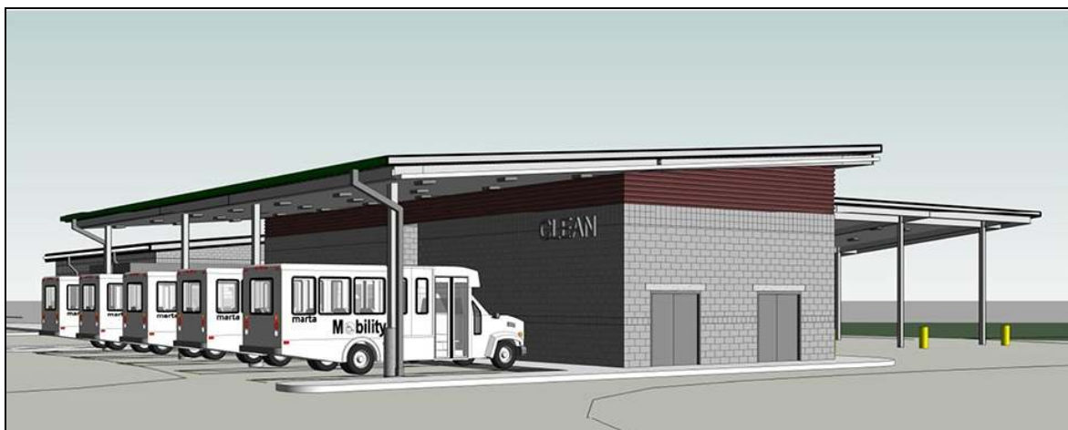
Figure 4- The Cleaning Section