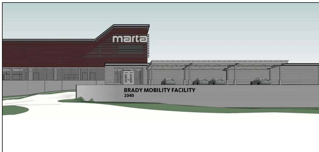
Figure 1 – The Brady Mobility Facility

The new facility at the MARTA Brady Mobility facility (see Figure 1), is being built on a site where a previous bus garage was located before demolition. The EdenCrete™ section of the project is scheduled to be constructed this month. The facility will house the administrative functions, operations, and maintenance facilities for a fleet of up to 200 Mobility vehicles (specialized vans and cutaway buses).