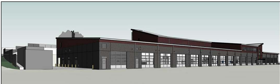
Figure 3- The Maintenance Section