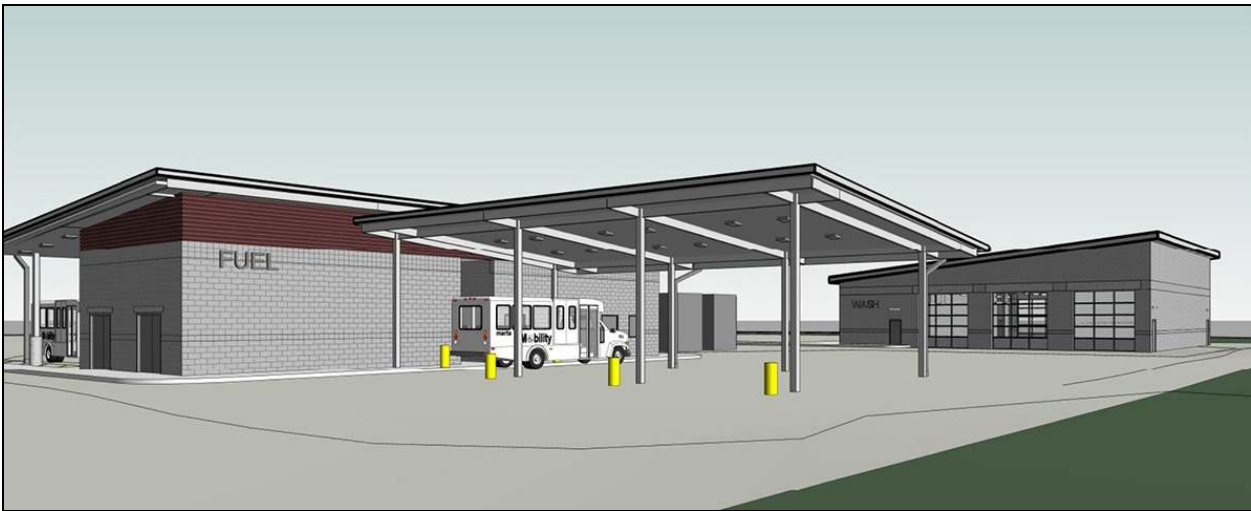
Figure 5- The Re-Fuelling Section

The Brady facility will serve as the “model of modern transit operations, maintenance design and technology. It will be safe, functional, easy to maintain, and significantly more energy efficient as a LEED Silver facility.” *