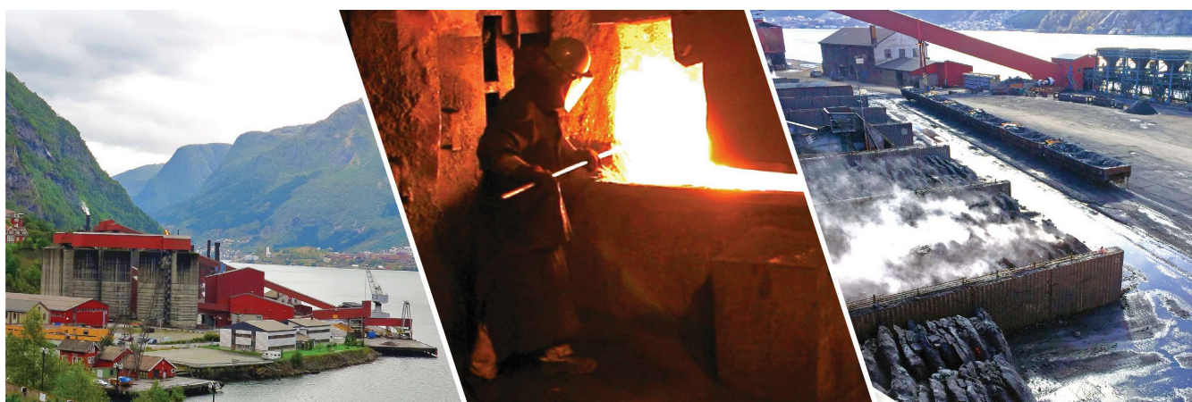
TiZir Titanium & Iron ilmenite upgrading facility, Tyssedal, Norway