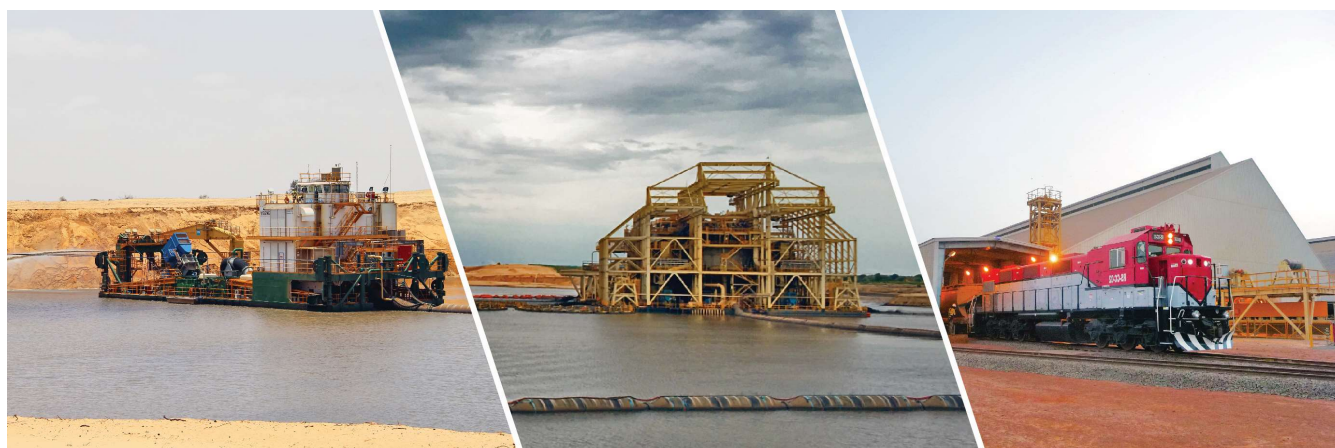
Grande Côte Operations, Senegal, West Africa

GCO was cash flow positive for the quarter. The impact of cost reduction initiatives along with record sales volumes for zircon, rutile and leucoxene were the main contributors to this result.