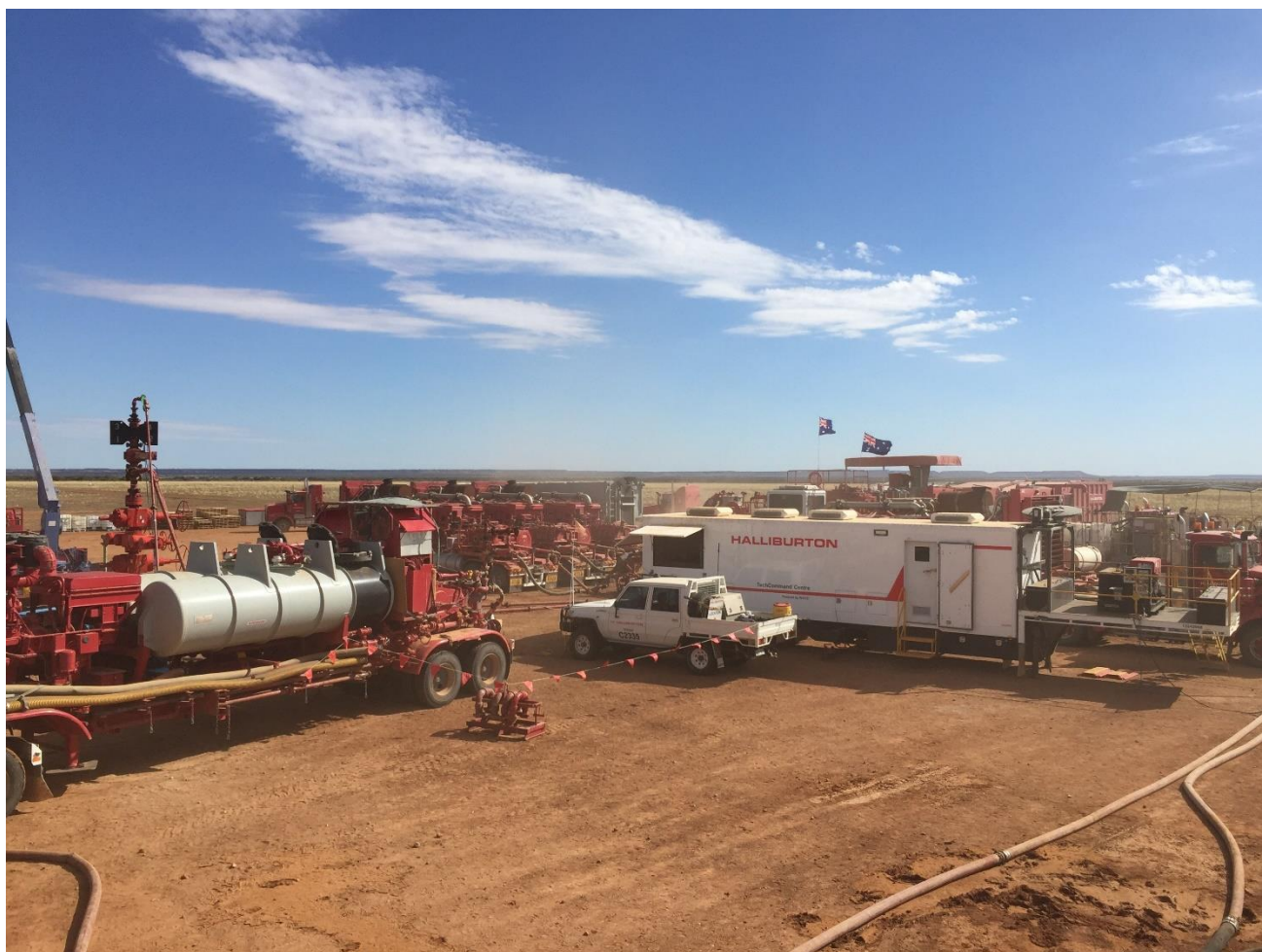
Equipment on site at Tamarama – 1