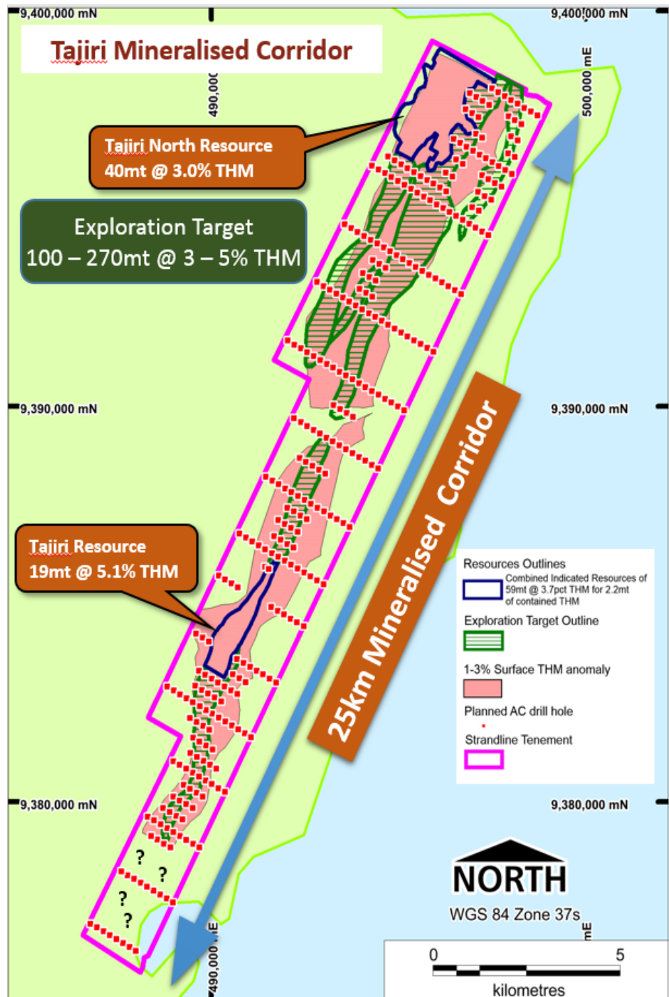
Figure 4. Planned Tajiri extension aircore drill plan

The Company has previously estimated an Exploration Target of 100 to 270mt at between 3% to 5% Total Heavy Minerals (THM) for this prospective 25km long zone (which is in addition to the existing Indicated Resources of 59mt @ 3.7% THM for 2.2mt contained THM). Strandline would caution the reader that the potential quantity and grade of the combined Exploration Target is conceptual in nature and shows there is insufficient supporting information to define a JORC Compliant Mineral Resource. It is also uncertain if further exploration and resource development work will result in the determination of a Mineral Resource.