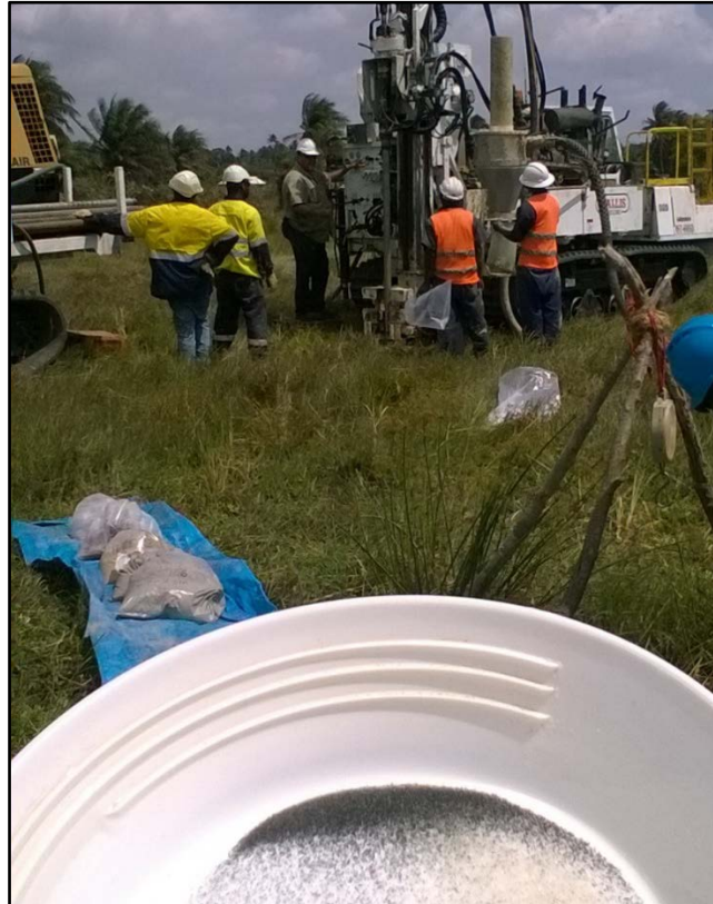
Figure 2. Aircore drilling at Fungoni with heavy mineral pan sample taken from that drill hole

As part of its development commitment, the Company lodged a preliminary Environmental Impact Assessment (EIA) Report for the Fungoni Project with the Tanzanian environmental regulatory authorities in late July 2016. A field visit by the Tanzanian Government's technical review panel will be carried out in early September. Feedback from this meeting will allow the report to be finalised efficiently.