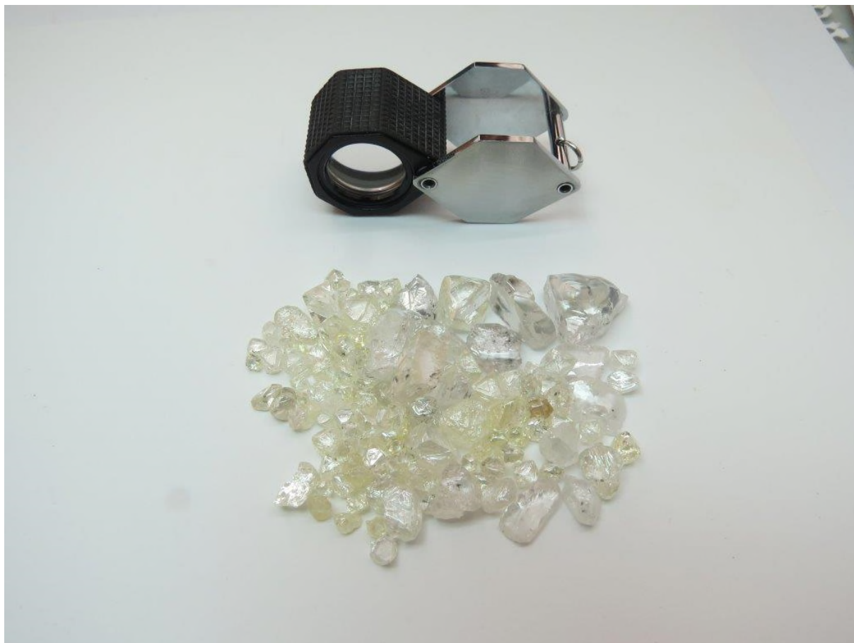
Selection of recent diamond recoveries from trial mining at the E46 alluvial terraces

These pink recoveries - together with the 4 carat pink recovered in the original exploration bulk sampling program - suggest the E46 diamond population should include fancy-coloured diamonds as well as large, high-quality gems.