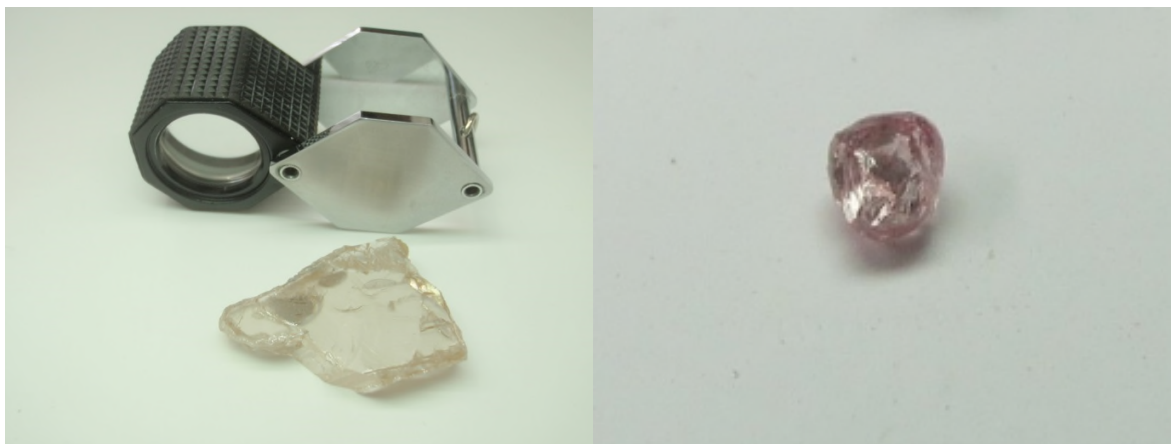
59 carat diamond from E46

The latest special diamond recoveries from E46 include a 59 carat Type I diamond and a 33 carat Type IIa D-colour gem.