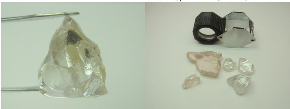
33 carat Type IIa D-colour gem from E46