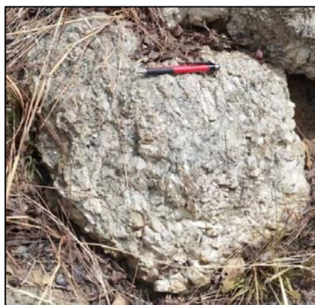
"Crowded" spodumene rock at Goulamina