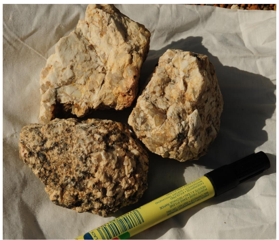
Figure 2: Pegmatite samples taken from the Shaw River Prospect