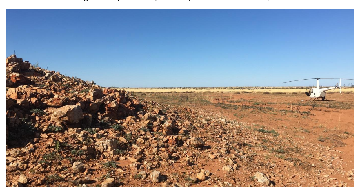
Figure 3: Field mapping at the Woodstock Prospect, Railway Project