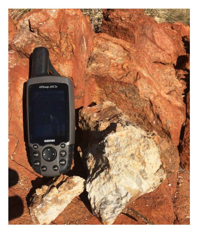
Figure 4: Outcropping pegmatites at the Woodstock Prospect, Railway Project